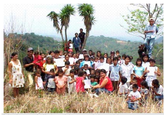
Mothers delighted in receiving title to property

It is in this land of many contrasts—the powerful and the powerless—that Rainbow of Hope arrived in 2001 and trekked though the rubble of homes destroyed by the earthquake. How no one lost their lives at Los Violetes is a miracle; 23 families were left homeless and landless because they did not own property and therefore were not entitled to government aid nor international bilateral aid given to the government to administer. With a matching grant from the Wildrose Foundation of Alberta, Rainbow of Hope funded the purchase of several hectares of land, divided into 23 plots with land titles given to the mothers. We also provided land for a community garden to feed their families.