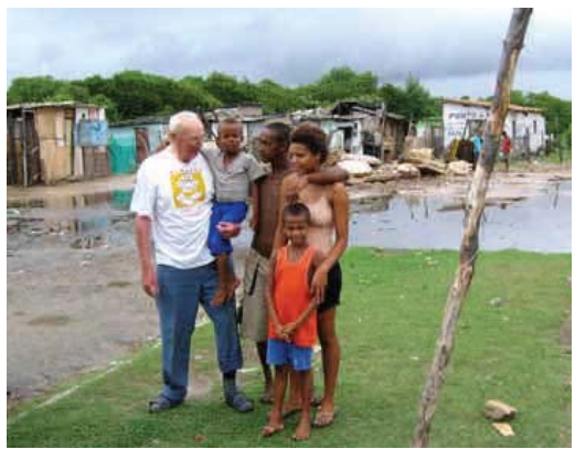
Poverty in Brazil 1999

It's not a question of merely giving. And certainly not of tossing something at the poor in contempt. No, it's a question of sharing.