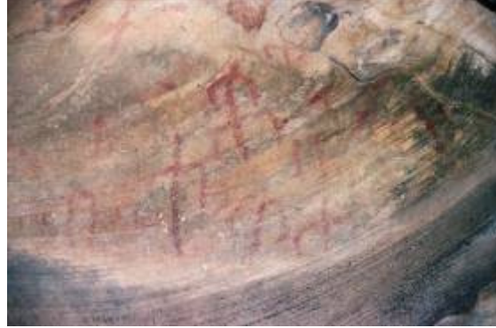
Neolithic Cave Paintings at Cueva de Los Letreros