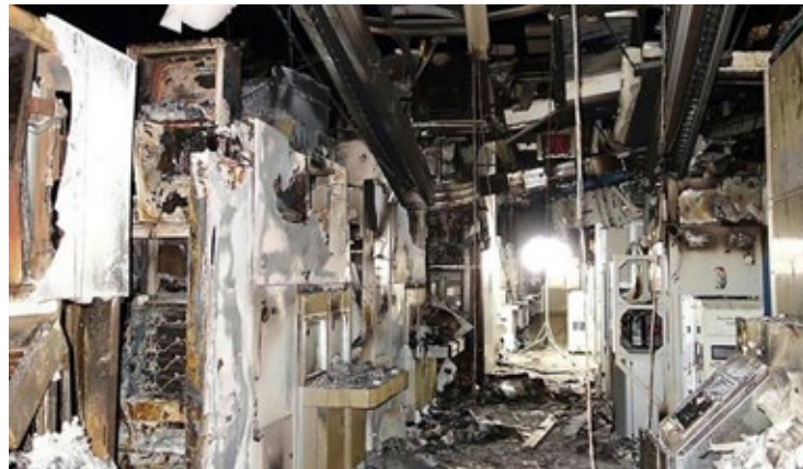
A factory fire at a large Japanese chip manufacturer has compounded the current shortage of semiconductors.

The shortages are threatening to slash $110 billion in sales from the car industry, consulting firm AlixPartners forecast in May, and has forced auto manufacturers to overhaul the way they get the electronic components that have become critical to contemporary vehicle design. (Information for this story from “Automotive News”). ■