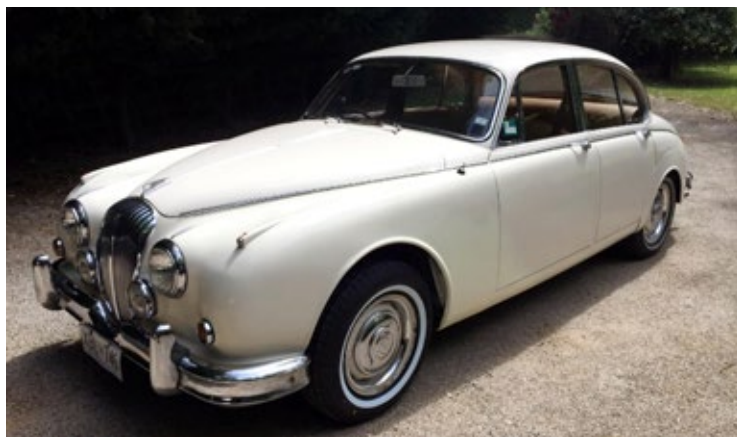
1965 Daimler 250 V8 auto. 53,000 miles. $55,000

The following is a collection of Mark II Jaguars were advertised for sale during July. The adverts are provided for information only, are not endorsed by our club, and the cars may no longer be available for sale.