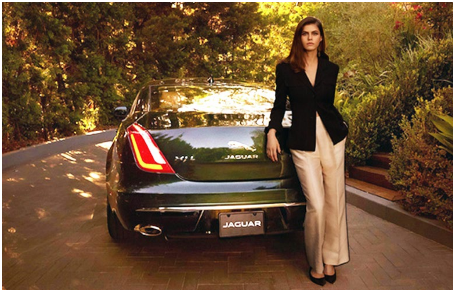
The design of the X351 was a complete departure from any earlier XJ model. The most talked-about exterior styling feature was the design of the back of the car. It featured a wide and full rear deck and wrap-over tail-lights with the suggestion of a 'cat's claw' in the lenses.