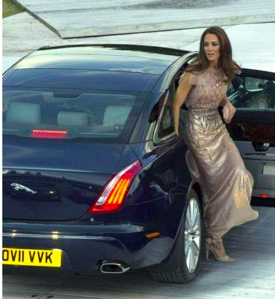
The Royal Family has a history of Jaguar ownership. Catherine Middleton, Duchess of Cambridge seen here in a XJ X351 long-wheelbase.