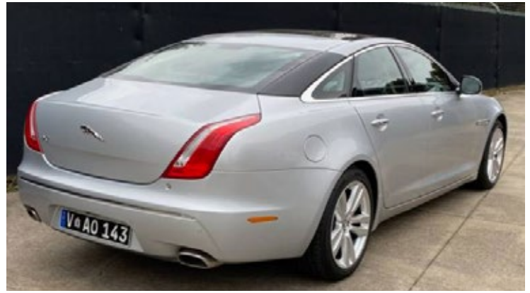
2012 XJ Premium Luxury SWB 3.0L Turbo Diesel, 141,301km $44,950.