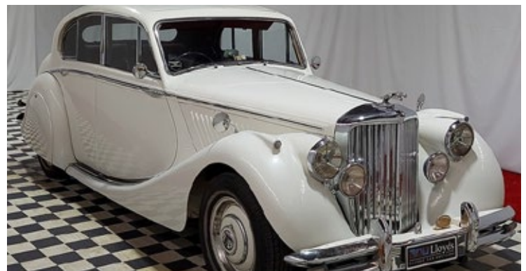
1949 Mark V, disc brakes and 5-speed manual conversation, custom vent guards, re-trimmed red interior. 20,492 Miles.