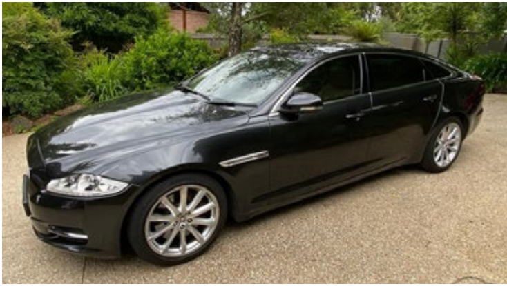
2011 XJ Premium Luxury LWB 3.0L Turbo Diesel 97,690km. $43,000

The following is a collection of XJ X351's that were advertised for sale during July. The adverts are provided for information only, are not endorsed by our club, and the cars may no longer be available for sale.