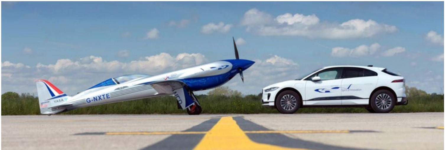
The Jaguar I-Pace can be rigged with the equipment to tow the Spirit of Innovation electric plane

The Spirit of Innovation, a Rolls-Royce all-electric airplane, is scheduled to take flight for the first time soon, and will be towed around the tarmac by a Jaguar I-Pace as a support vehicle.