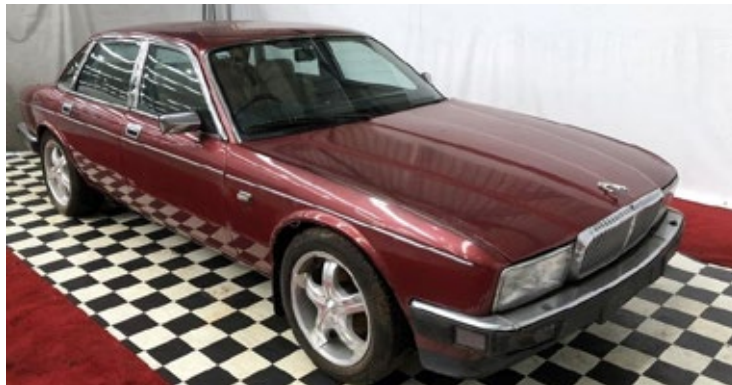
1990 Daimler XJ40 4.0 litre saloon. Does not start or drive. The body has marking all over it and rust in some area's.