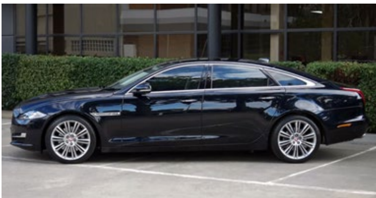
2017 XJ Premium Luxury LWB 3.0L Turbo Diesel, 90,610km $84,777