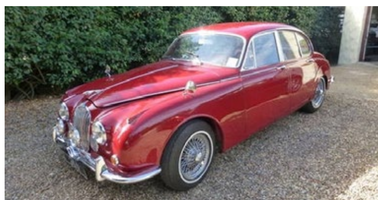
1960 Mark II 3.8 litre manual. 42,884 km. $92,000