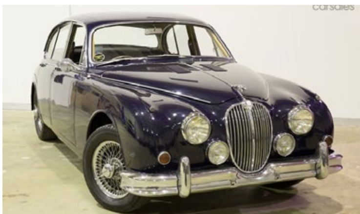
1960 Mark II 3.8 litre manual. 11,092 km. $74,800