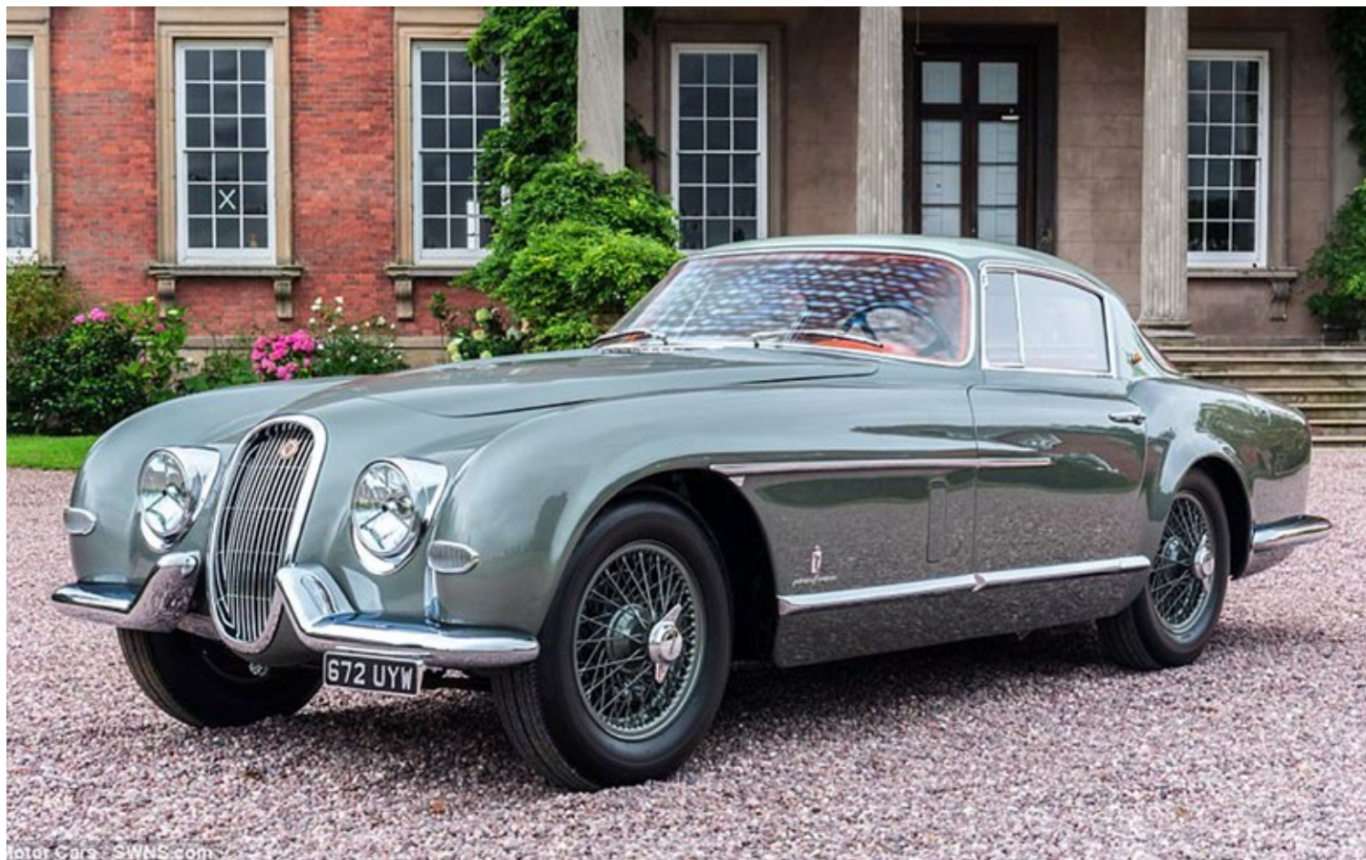
This unique long-lost Pininfarina-bodied 1954 Jaguar XK120 SE, the only one in the world, has been restored to its original condition after a painstaking process, taking almost 8,000 hours. The car was in the U.S. and had been in storage for 40 years.