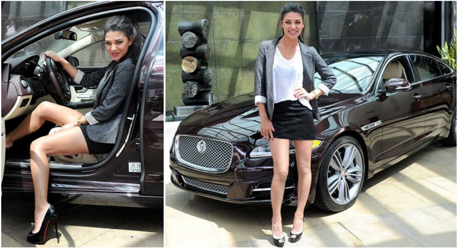
Jaguar Ambassador and actress Jessica Szohr ("Gossip Girl") at a 2011 "Jaguar XJ Driving Experience" promotion in Miami, Florida.