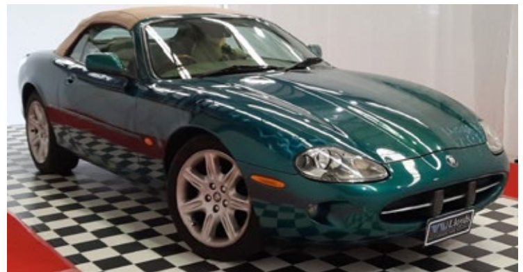
1997 Jaguar XK8 Convertible. 164,884 km.