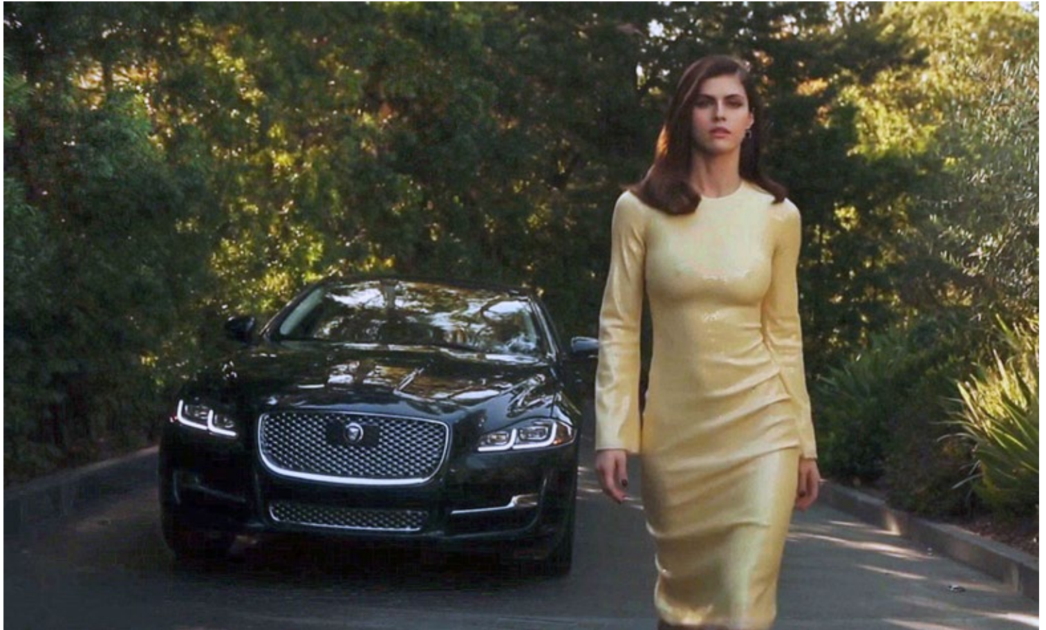
Advertisement for the 2019 "XJ Collection Special Edition". Jaguar teamed up with American actress Alexandra Daddario (Baywatch 2017) for a promotional photo-shoot. (The XJ was built in the UK while Alexandra has Italian, Irish, Hungarian/Slovak ancestry).