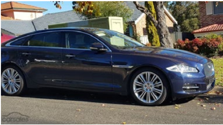
2014 XJ Premium Luxury LWB 3.0L Turbo Diesel 149,517km. $51,999