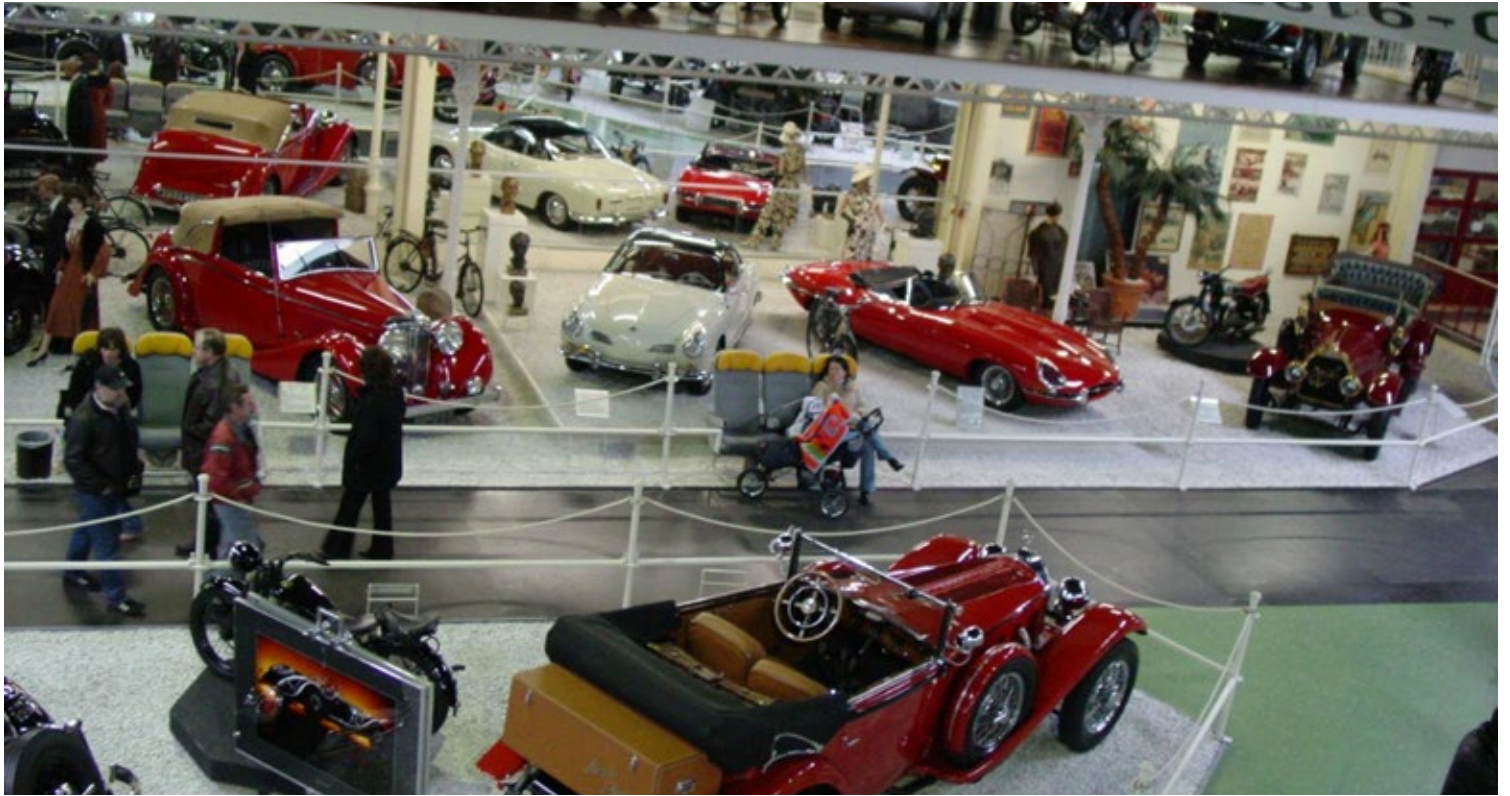
There were more Bugatti's and many more Mercedes (although a little more modern this time), and even more Trains.