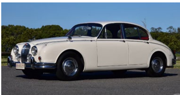
1960 Mark II 3.4 litre manual. 143,975 km. $69,950