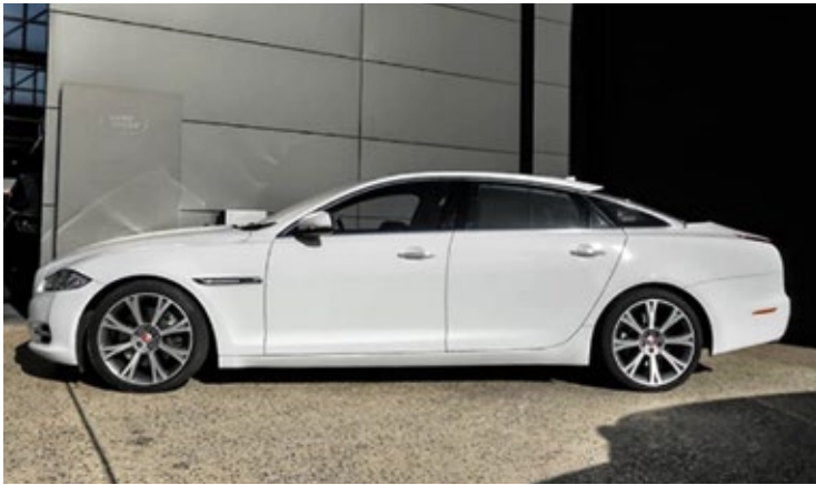
2014 XJ Premium Luxury LWB 3.0L Turbo Diesel, 49,200km. $69,500