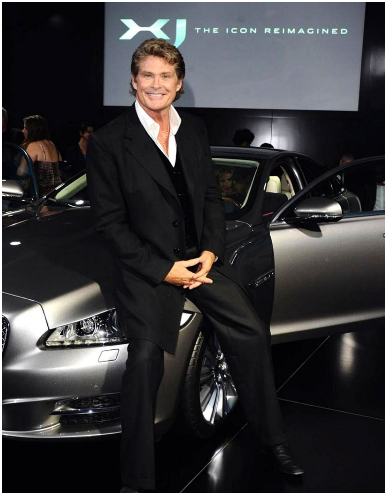
American actor David Hasselhoff ("Knight Rider"; "Baywatch"), together with Jay Leno and Elle McPherson, at the 2009 Launch of the Jaguar XJ X351 at the Saatchi Gallery in London on 9 July 2009.