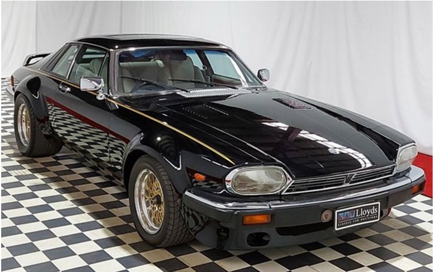
Ex Kerry Packer modified 1977 XJ-S fitted with twin-turbo 7.0 litre V12 engine and 5-speed manual gearbox for sale at Lloyds Auction.