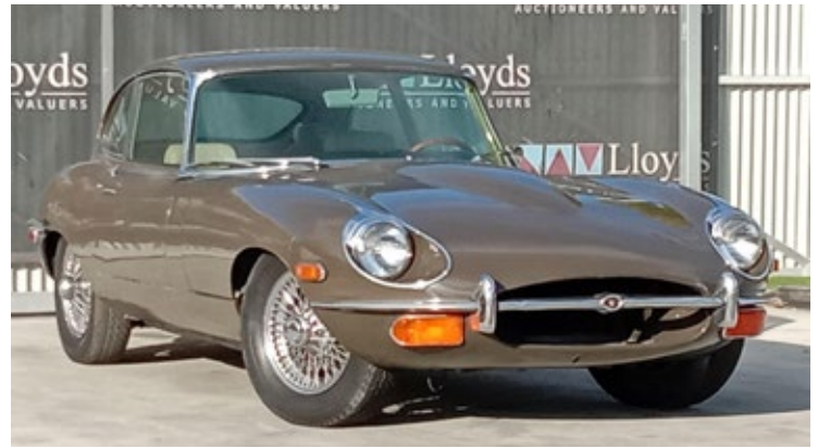
1969 Jaguar E Type Series II (2+2 auto). First owner from 1969 to 2019. New paint, original interior. 59,679 Miles.