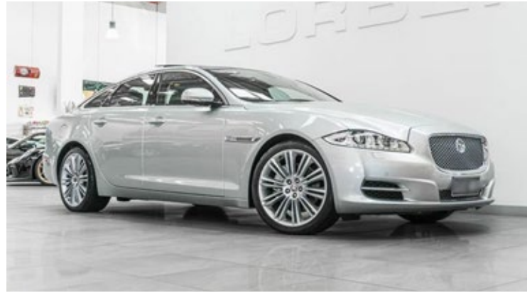
2011 XJ Premium Luxury SWB 3.0L Turbo Diesel 81,547 km. $59,990