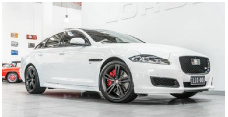
2017 XJ R SWB Supercharged V8. 34,112km. $139,990