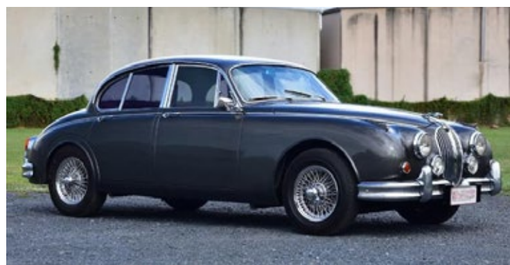
1962 Mark II 3.8 litre manual. 129,714 km. $69,950