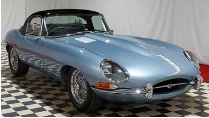
1966 Jaguar E-Type Roadster Series 1. Ex LHD. Full restoration by Jag E Type Restorations in 2006. Includes hard top.

Lloyds Timed Online Auction (Closes 31st July 2021)