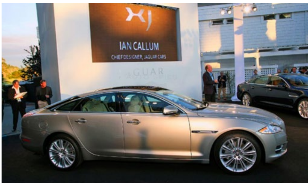
In the US, the XJ was unveiled at the 2009 Pebble Beach Concours d’Elegance. Like the X350, the X351 had a monocoque structure made from aluminium alloy components riveting and bonded together with aerospace-based processes. The car was 50kg lighter than the smaller XF.

In December 2012, standard safety equipment was extended to include a blind spot monitoring system.