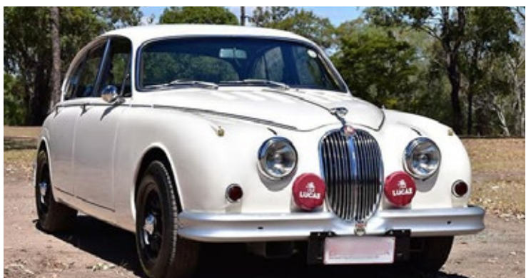
1960 Mark II 2.4 litre manual. 29,075 km. $79,950