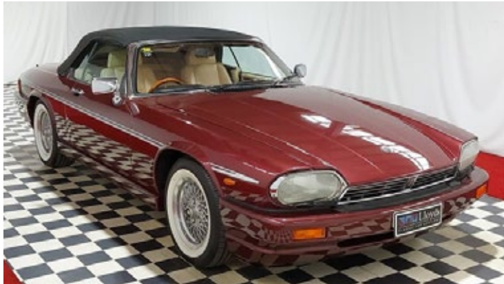
1991 Jaguar XJS V12 Convertible, Australian delivered 5.3 litre V12 auto. 128,860 km.