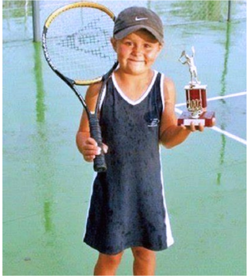
Ashleigh Barty is a Jaguar Ambassador, along with Australian professional surfer Sally Fitzgibbons. Ash drives a Jaguar F-PACE.

Ahead of the tournament, Jaguar announced it has renewed its partnership with the All-England Tennis Club (AELTC) for another five years. As Official Car of the Championships, Wimbledon, Jaguar supplies a fleet of vehicles, including the Jaguar I-PACE, to support the operations of the event. ■