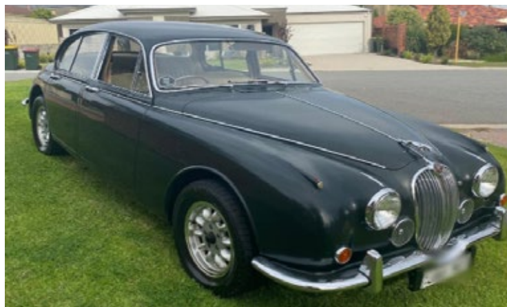
1966 Mark II 240 manual. Original Unrestored. 33,000 km. $50,000