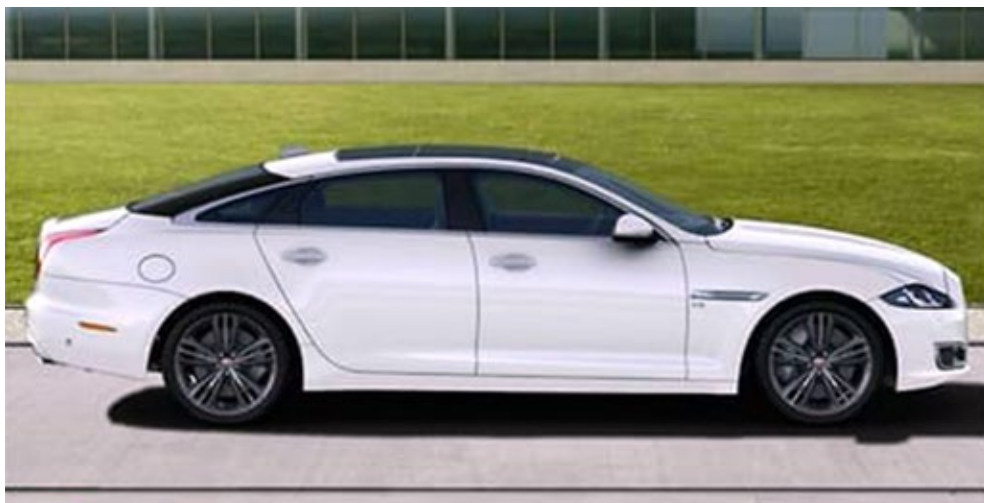
XJ Autobiography. Here we're looking at the co-flagship of the range, which at the time, was the second-most expensive Jaguar you could buy in Australia. In 2017 the XJ Autobiography Long Wheelbase was priced at A$299,995 (before on-road costs).

The X351.III included a more powerful 3.0-litre turbo-diesel engine which had new eight-hole piezo injectors (operating at up to 2000 bar). The primary turbocharger featured ceramic ball bearing technology for faster torque build-up and the introduction of a