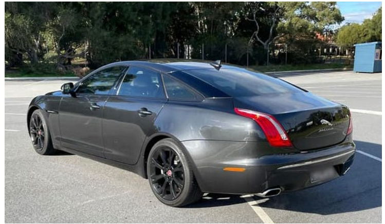
2014 XJ Portfolio SWB Supercharged 3.0L V6. 52,690km. $71,000