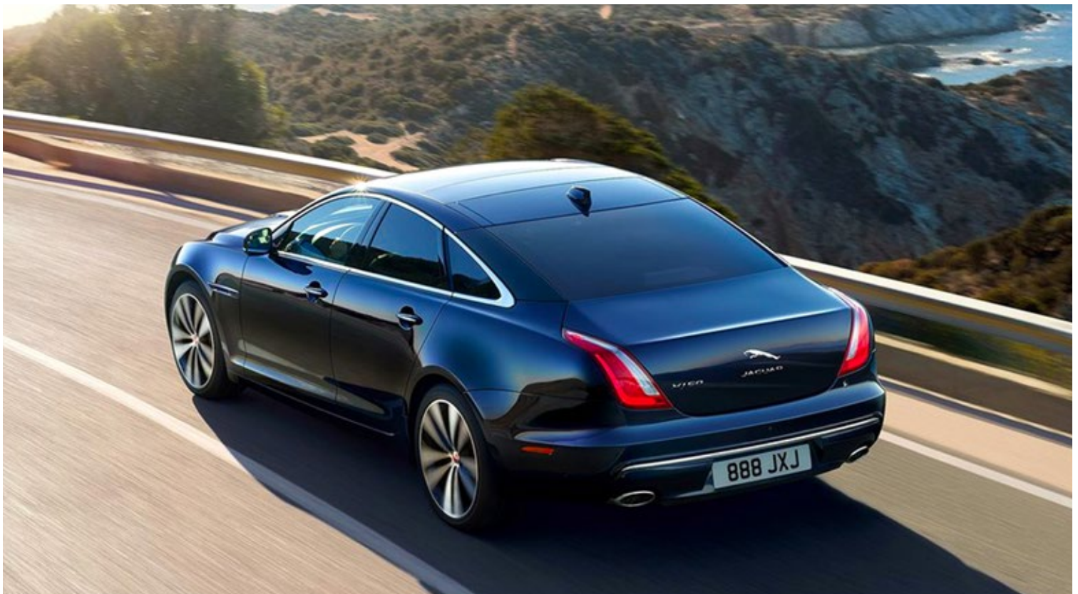
Jaguar marked 50 years of its flagship XJ luxury saloon with the production of the "XJ 50 Special Edition". The car was launched at the Beijing Motor Show in 2018 to celebrate half a century of trademark performance, technology and luxury.

Developed for the X152 F-Type, the Quickshift transmission enabled the driver to perform sequential shifts via steering wheel-mounted paddles and, when downshifting, the engine management system automatically