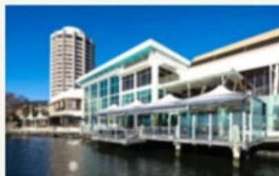
Wrest Point Casino