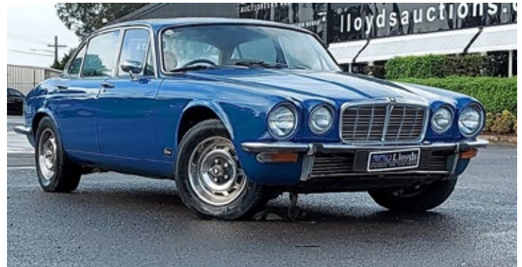
1977 Jaguar XJ, Currently not running, will not start, rust evident on body panels, cruise control, alloy wheels. 70,346 Kilometres