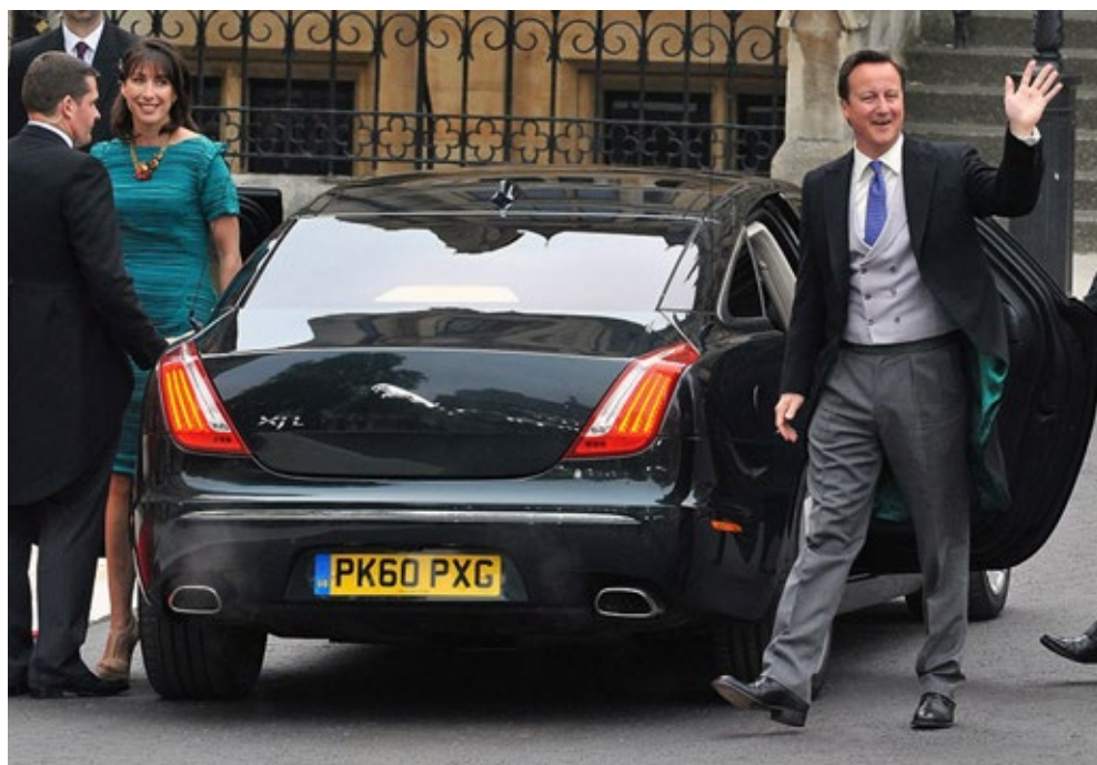
In 2010, David Cameron bought a fleet of armoured, custom built Jaguar XJ Sentinel's for use as Prime Ministerial cars. Each state-of-the-art armoured limo's were estimated to have cost £300,000.

The cars had substantial under-floor grenade protection and ballistic protection up to B7 levels (which covers handguns, assault rifles and even armour-piercing weaponry).