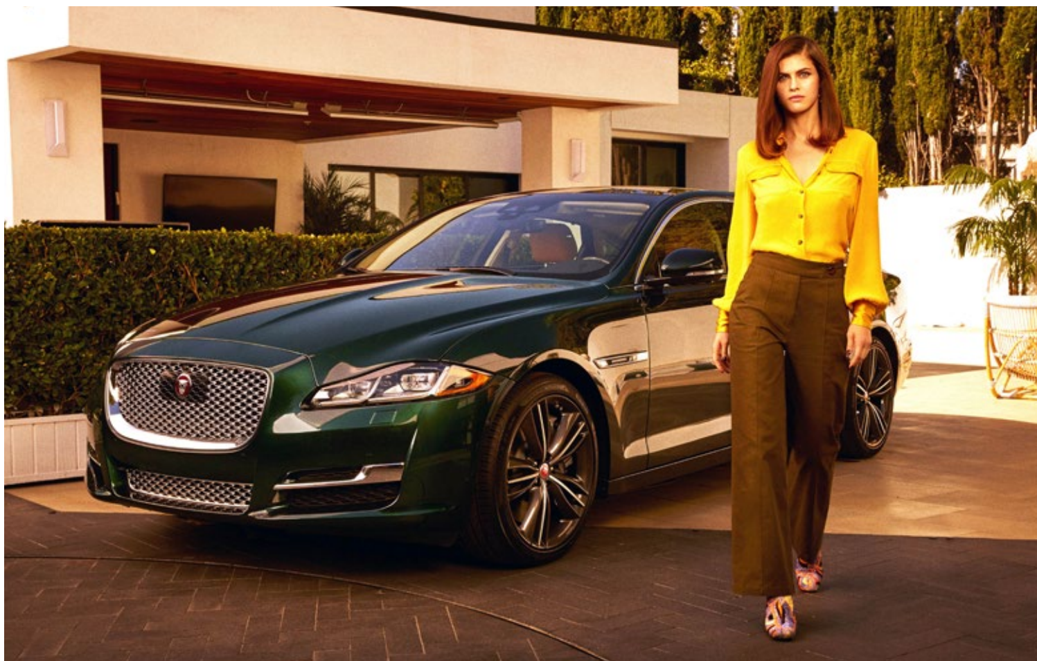
Jaguar and actress Alexandra Daddario from "True Detective" and "Why Women Kill" teamed up to capture the beauty and essence of Jaguar's final run of the last generation XJ saloon. Known as the "XJ Collection Special Edition", this exclusive luxury sedan was only available to 300 customers and was based on the XJ X351 LWB 470 horsepower Supercharged V8.

This 575hp big cat not only provided high-octane performance but high-quality comfort.