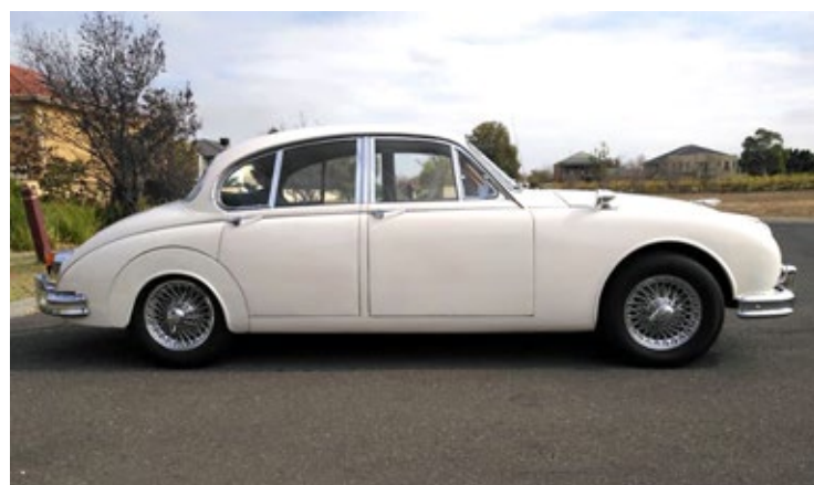
1962 Mark II 3.4 litre manual. 63,500 km. $75,000