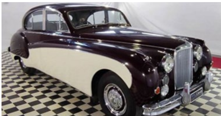
1959 Mark IX, 3.8 litre auto. 42,000 Miles