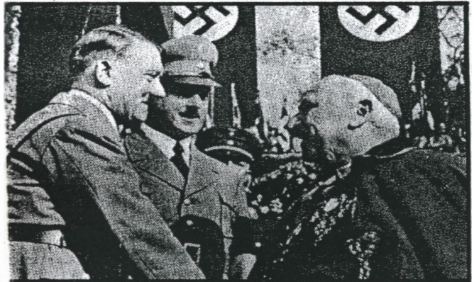
Poster proclaiming Papist-Nazi solidarity.

What appeared to be just another war of aggression was in reality another brutal Roman Catholic inquisition.