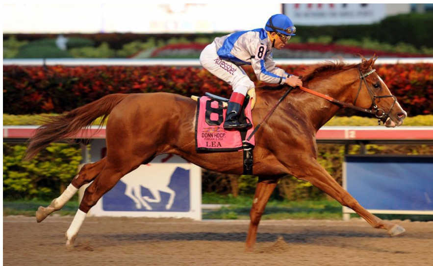
Lea winning the 2014 Donn Handicap in course record time