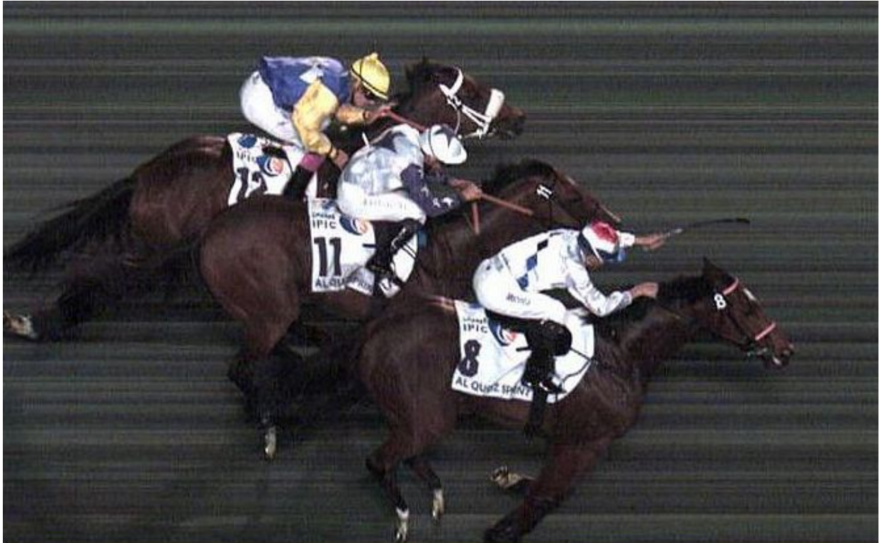
Al Quoz Sprint 2014: 1 Amber Sky 2 Ahtoug 3 Shea Shea