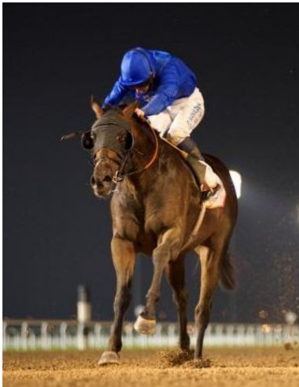
Maftool winning the Guineas.