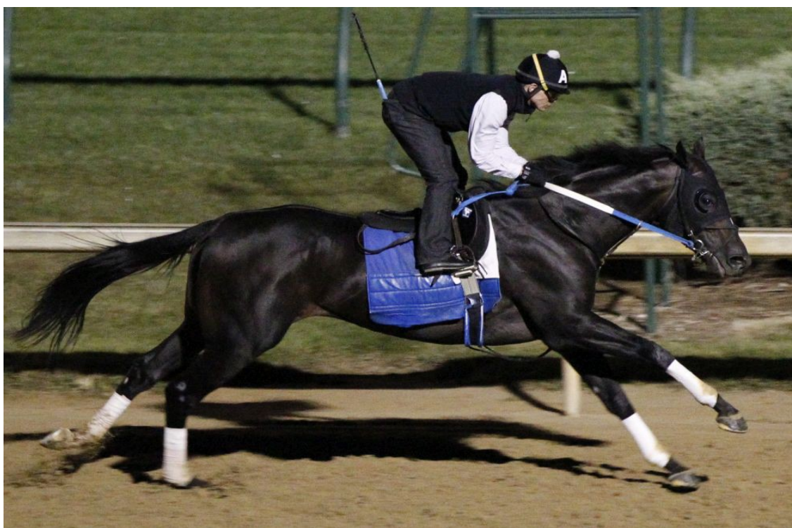
Prayer for Relief is set to join Mike de Kock in Dubai.