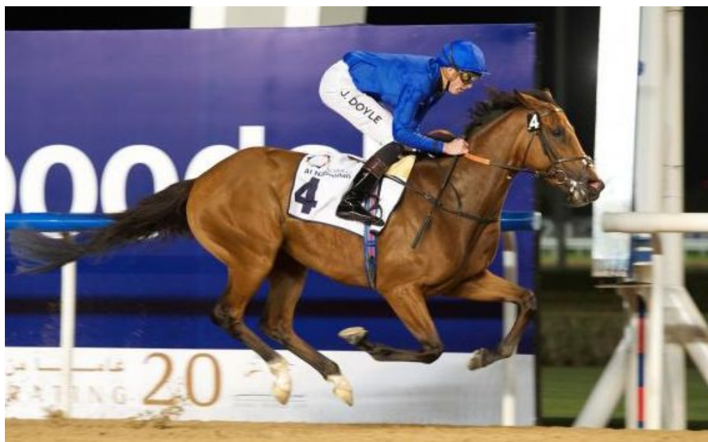
Local Time – easy winner of the UAE Oaks.

UAE Oaks (G3) / $250,000 3-year-olds, Fillies – 1,900 metres – Dirt 2015: LOCAL TIME (GB) Globeform 112p 2014: Ihtimal (IRE) (Tapeta)