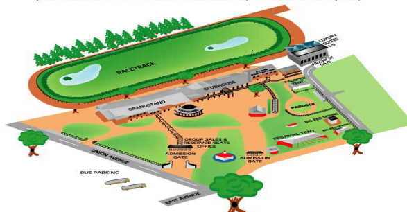
SARATOGA RACE COURSE