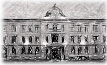
Hotell & Ressort