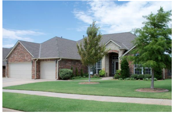
July Winners Kip Welch & Kyle Rogers 5400 NW 119<sup>th</sup> Street