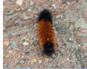
Woolly Bear Caterpillar