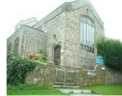
Our Lady of Lourdes

Broad Green/Cowley Drive Woodingdean BN2 6TB