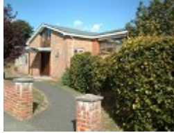
St. Patrick's Church

Broad Green/Cowley Drive Woodingdean BN2 6TB