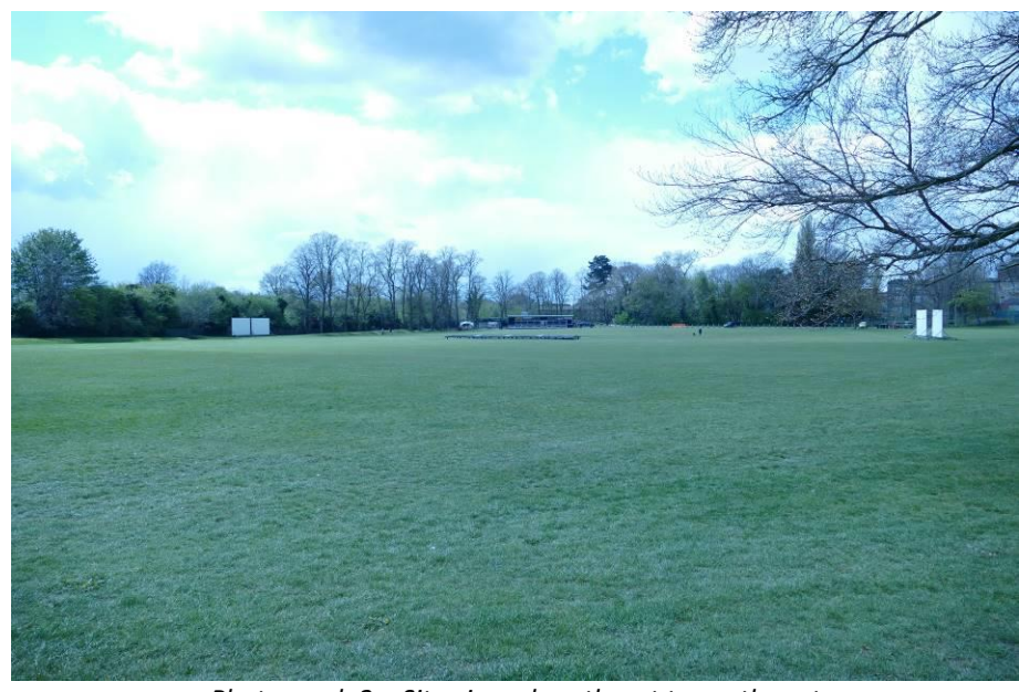
Photograph 2 – Site viewed northeast to southwest