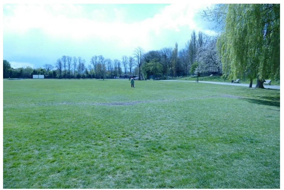
Photograph 1 – Site viewed north to south along its western boundary

2.1 Photographs of the site are provided throughout this report. The site comprised a 5.2 hectare (ha) of land currently very well maintained and very shortly mown on a regular basis. To the southwest of the site is the cricket pitch of the Ashby Hastings Cricket Club and a bowls green to the east of the site. The site had an all-weather perimeter path, part of which ran under a mature parkland treeline including ash (Fraxinus excelsior), beech (Fagus sylvatica), cherry (Prunus spp.), hawthorn (Crataegus monogyna), horse chestnut (Aesculus hippocastanum), large-leaved lime (Tilia platyphyllos), sycamore (Acer pseudoplatanus) weeping willow (Salix x sepulcralis) and yew (Taxus baccata).