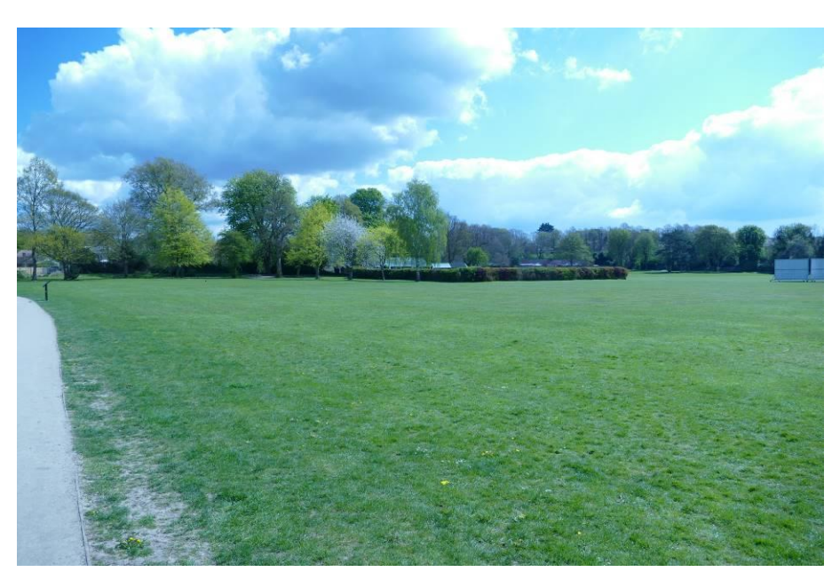
Photograph 4 – Northern section viewed NE toward the bowling green

Please note that the culverted and gardened southern boundary, not part of this site survey, was a good example of what could be implemented over many of the less used corners of the Bath Ground. This area is currently managed by Friends of Bath Ground.