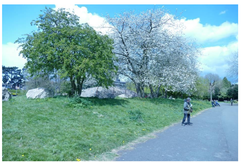
Photograph 6 – The embanked area to the NW of the site boundary.