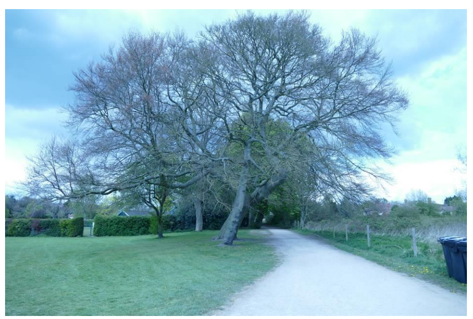
Photograph 3 – The eastern boundary of the site showing the all-weather perimeter walkway and mature trees.

2.2 The site is situated in a greener area of the older urban centre of Ashby de la Zouch (see aerial photograph below). Ashby de la Zouch is a Designated Conservation Area.