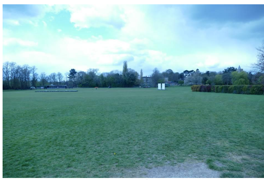
Photograph 5 – Southern section, viewed from the bowling green to the SW.