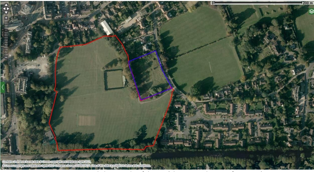
Figure 2 – Aerial Photographs of the site (please note these are from 2011)