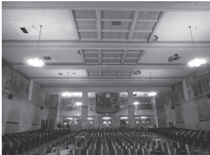
Location: Technical (Tech) High School Auditorium showing interior water damage (2019)

This article is the third in a series to save and preserve the Mann murals for future generations of Durfee students and to keep classmates informed as the project progresses.