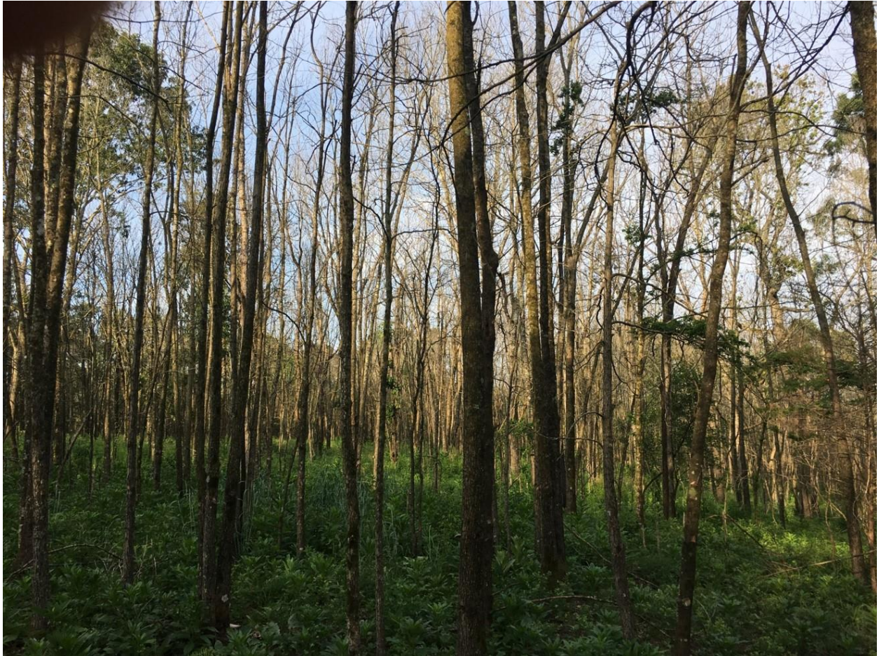
Forest stand improvement work conducted via hack-and-squirt herbicide application on sweetgum. Notice understory herbaceous response.