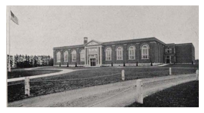
The "new" high school, today's middle school, is seen shortly after it was built. In 1932.

Bethlehem Central High School, which opened with an enrollment of 418 students in grades 10-12, now administers to slightly more than 1600 students in grades 9-12. The school district maintains an excellent reputation. According to the high school's website, "In August of 2015, Bethlehem Central High School was named one of the Top 500 high schools in the nation by Newsweek coming in at #247." In 2017, the school district was ranked #5 among 600 upstate New York high schools and ranked #1 in the Albany area by the Albany Business Review. It's certain the early Board of Education members would be very proud.