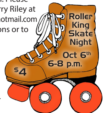
(Inline skates are an additional cost)

Note: There will not be a book exchange in November or December.