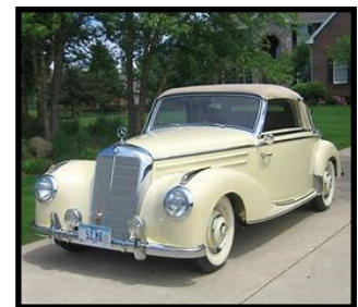
1950's 220 Cabriolet