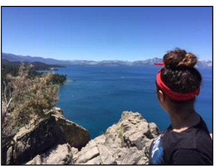
HeartWood trip up the Welch-Dickey Loop and Zumix gets on top of Cave Rock at Lake Tahoe!