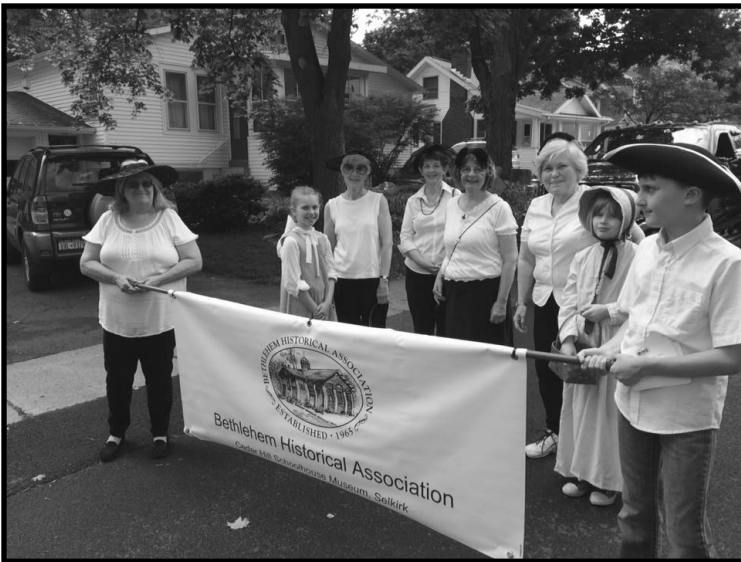
Our contingent gets ready to step off in the Bethlehem Memorial Day Parade. In all, ten of us represented BHA. The crowds were large and enthusiastic; the weather was perfect. – and we got to wear some neat vintage hats!