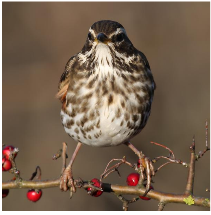
Redwing at Botolph's Bridge Road (Brian Harper)

Redwings are often noted on nocturnal passage when their calls are one of the most evocative sounds of this time of year, and large movements at night are unquantifiable. Arrival can continue well into November but diurnal passage at least involves small numbers and movements of 200 or more are noteworthy: 200 grounded at Capel Battery on the 8<sup>th</sup> November 2003, 200 in off the sea at Samphire Hoe on the 6<sup>th</sup> November 2011 and 500 flying over Beachborough Park on the 10<sup>th</sup> November 2016.