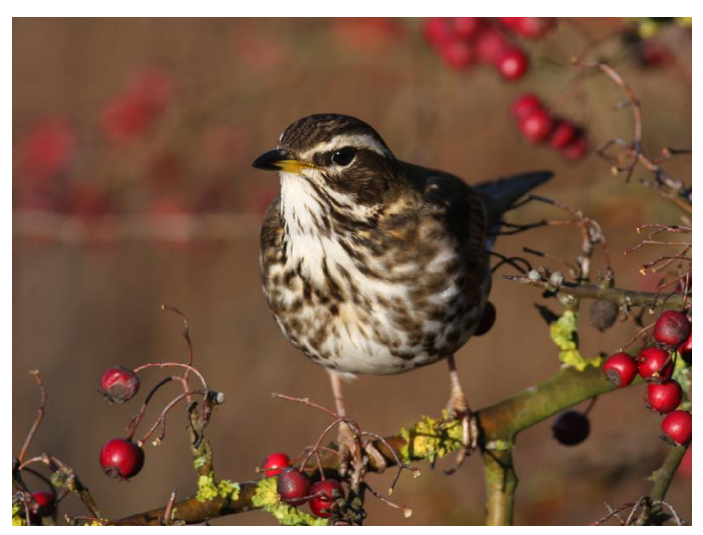
Redwing at Botolph's Bridge Road (Brian Harper)