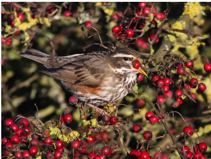
Redwing at Botolph's Bridge Road (Brian Harper)