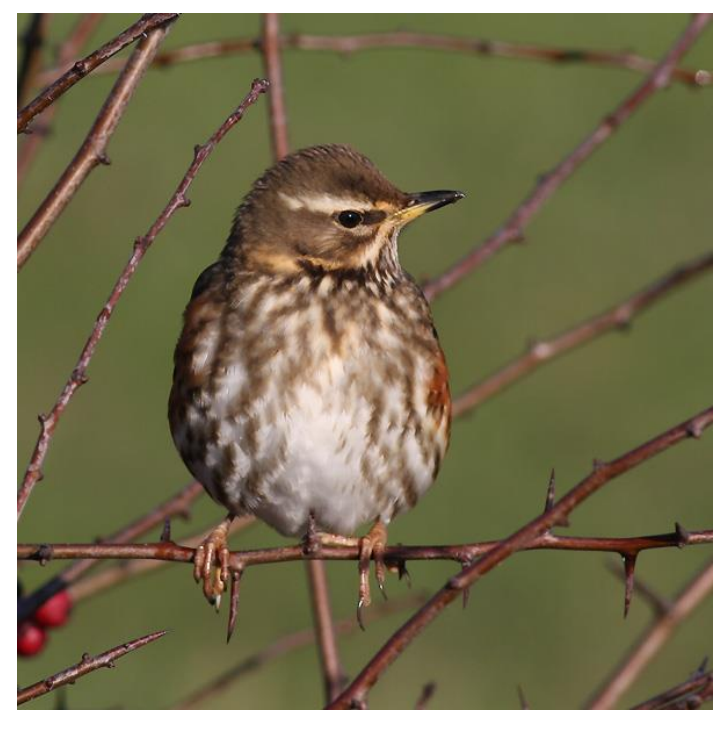
Redwing at Botolph's Bridge Road (Brian Harper)