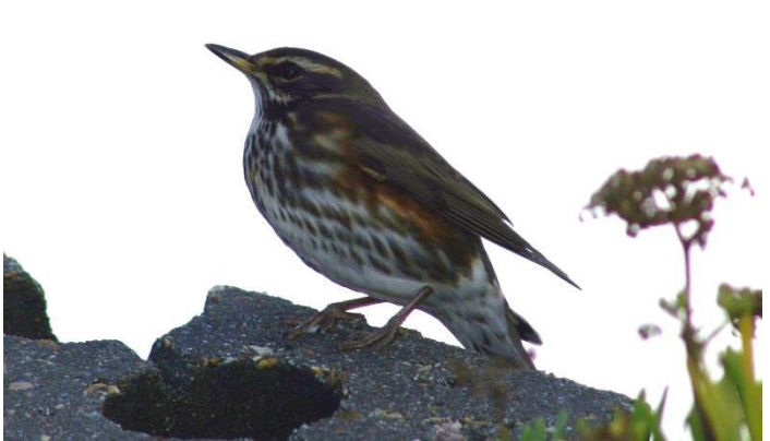
Redwing at Samphire Hoe