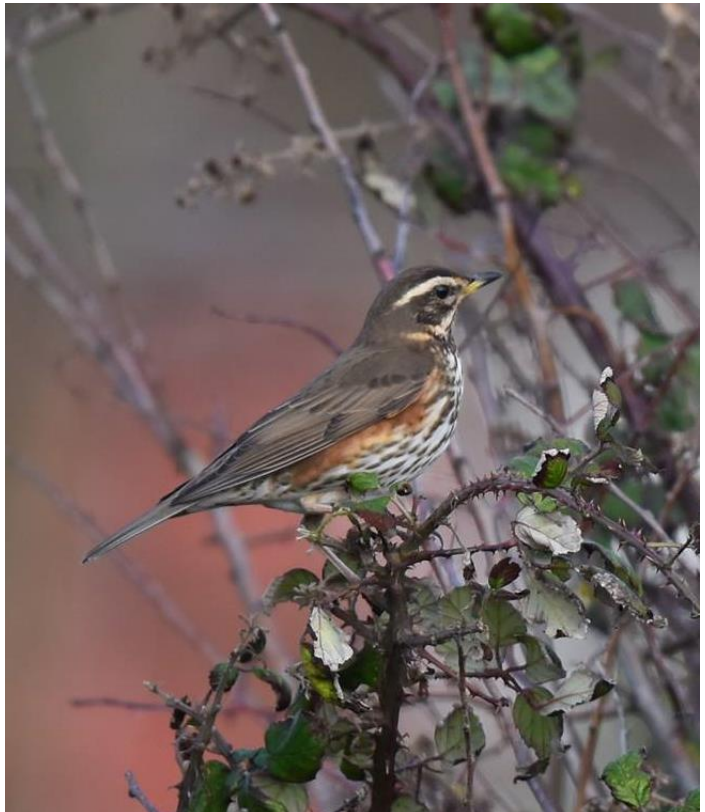
Redwing at Princes Parade (Nigel Webster)

Up to 1,200 at Beachborough Park in late November/early December 2018