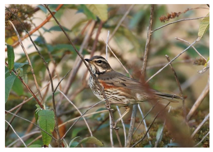
Redwing at Samphire Hoe