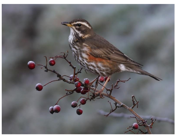
Redwing at Botolph's Bridge Road (Brian Harper)