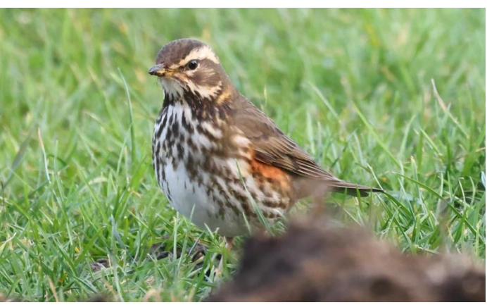
Redwing at Hythe (Glenn Tutton)