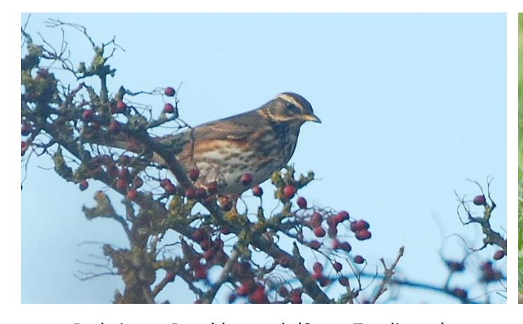
Redwing at Beachborough