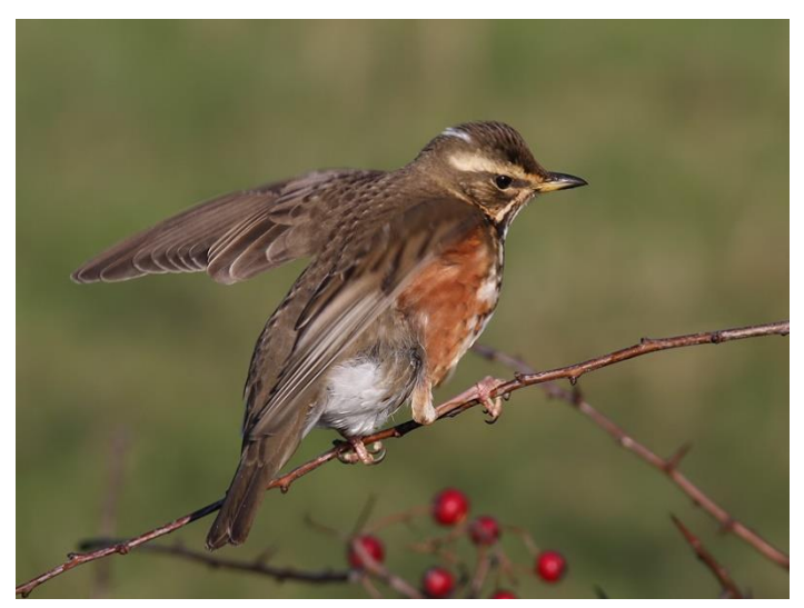
Redwing at Botolph's Bridge Road (Brian Harper)