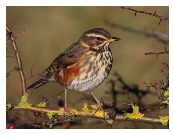
Redwing at Botolph's Bridge Road (Brian Harper)

In Kent it is a common winter visitor and passage migrant, with occasional summer records and has bred.