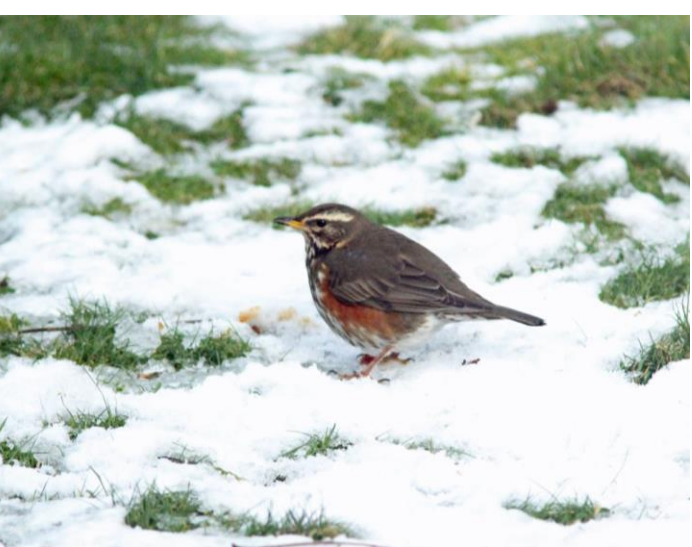
Redwing at Sellindge