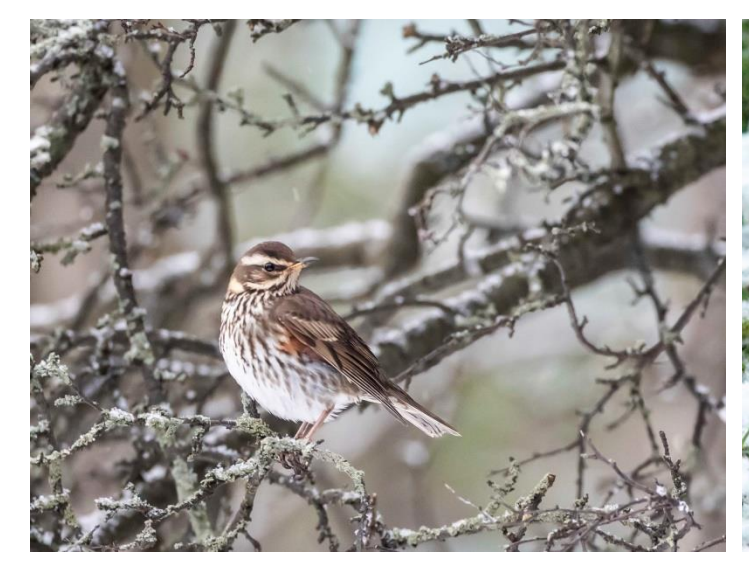
Redwing at Botolph's Bridge Road (Brian Harper)