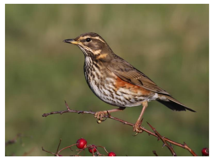
Redwing at Botolph's Bridge Road (Brian Harper)

2,835 in/north (including 1,100 at Abbotscliffe and 1,250 at Copt Point) on the 11th October 2020