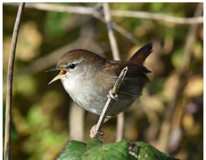
Cetti's Warbler at Princes Parade (Nigel Webster)