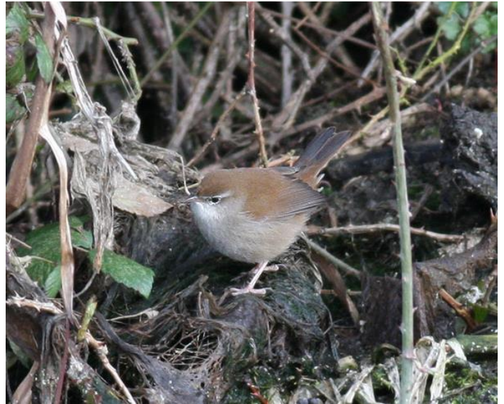
Cetti's Warbler at West Hythe (Brian Harper)

In Kent it is a scarce but steadily increasing resident breeding species.