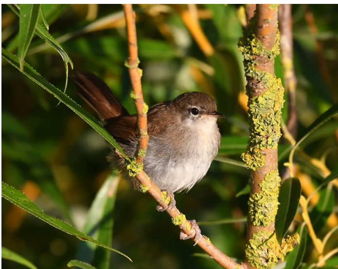
Cetti's Warbler at Princes Parade