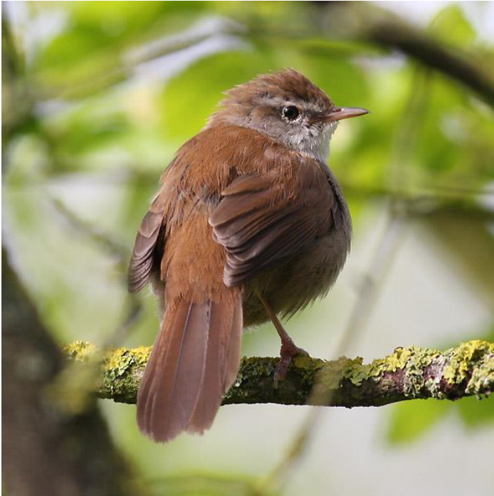
Cetti's Warbler at West Hythe

This suggests that the total area population in the region of around 15 pairs.