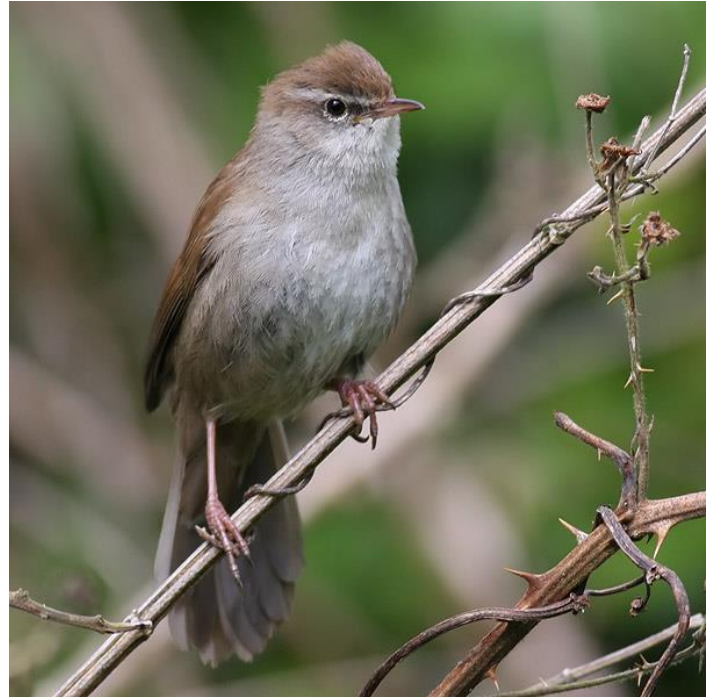
Cetti's Warbler at West Hythe