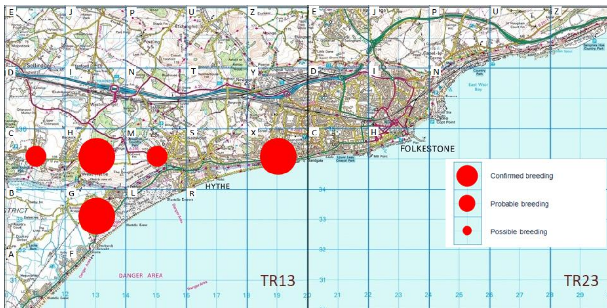
Figure 1: Breeding distribution of Cetti's Warbler at Folkestone and Hythe by tetrad (2007-13 BTO/KOS Atlas)

Figure 1 shows the breeding distribution by tetrad based on the results of the 2007-13 BTO/KOS atlas fieldwork.