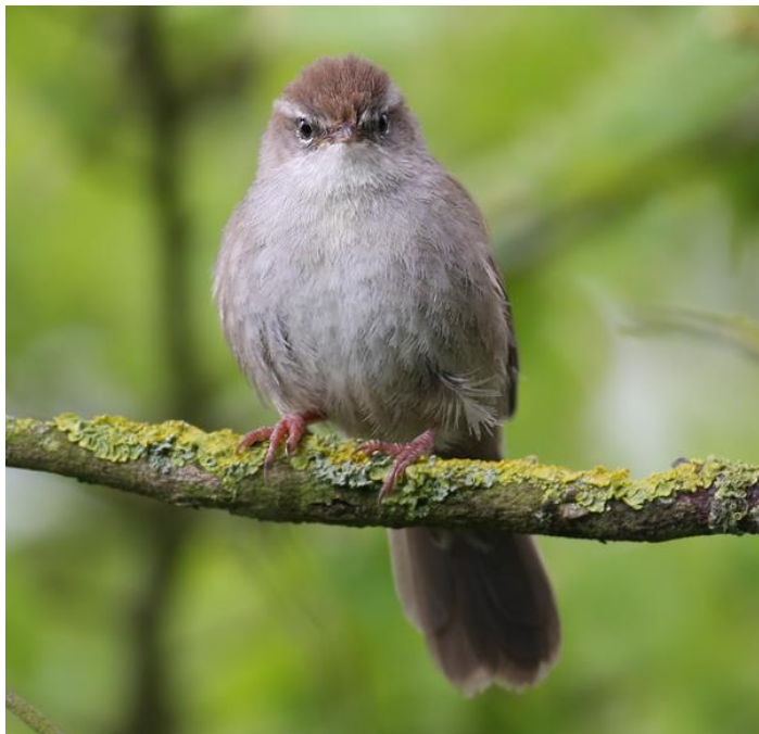
Cetti's Warbler at West Hythe (Brian Harper)

The only other migrant records have involved one seen in gorse bushes at Abbotscliffe on the 27 th October 2011 and one reported from Copt Point on the 14 th June 2020.