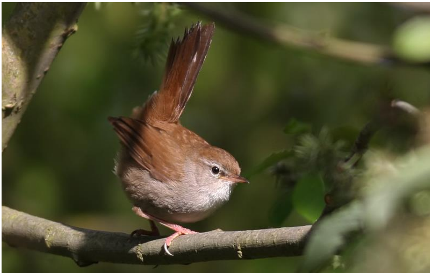
Cetti's Warbler at West Hythe