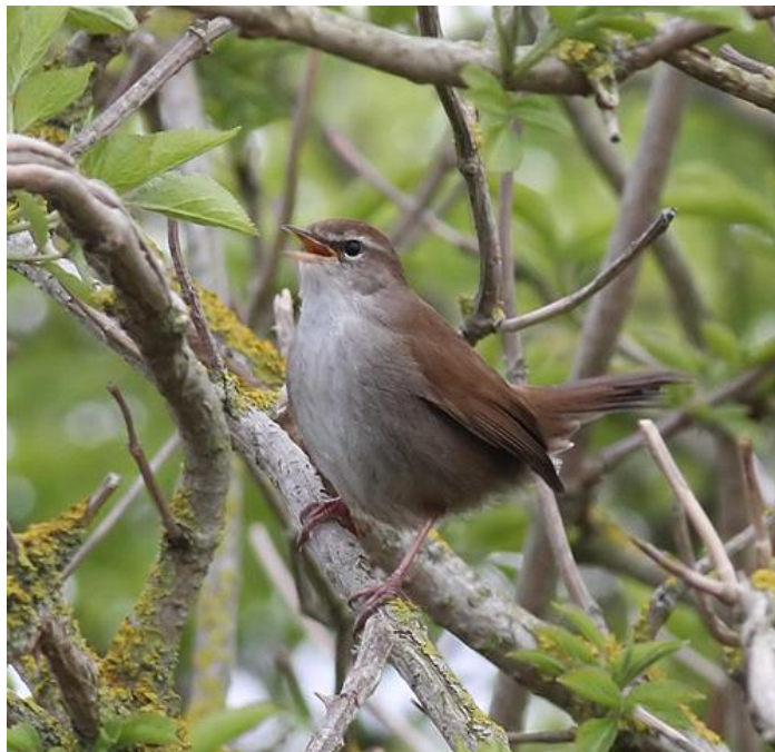
Cetti's Warbler at Botolph's Bridge (Brian Harper)