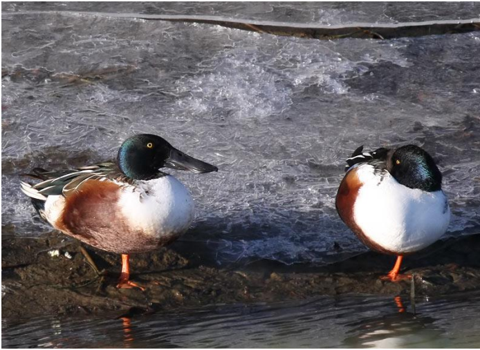
Shovelers at Botolph's Bridge (Brian Harper)

The tetrad map images were produced from the Ordnance Survey Get-a-map service and are reproduced with kind permission of Ordnance Survey .