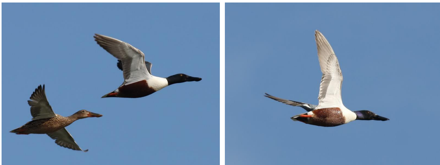
Shovelers at Nickolls Quarry