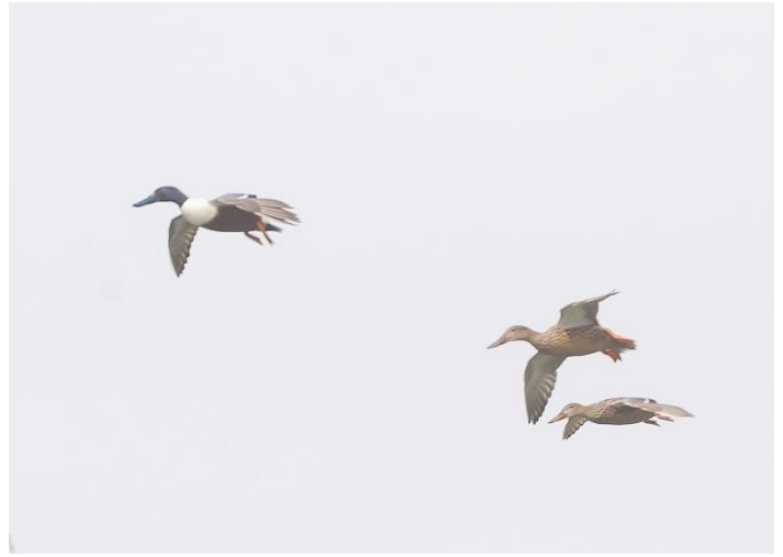
Shovelers at Beachborough