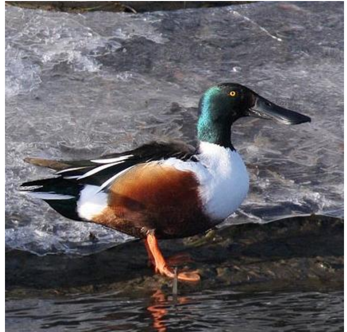
Shoveler at Botolph's Bridge (Brian Harper)

It was nationally scarce in the nineteenth century and was not included in Knight and Tolputt's "List of birds observed in Folkestone and its immediate neighbourhood" (1871), but protection after the 1880s led to its colonisation of much of lowland England.