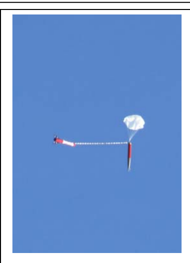
The Buccaneer descending on the drogue parachute