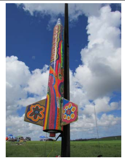
The Old Hippie Rocket ready to go