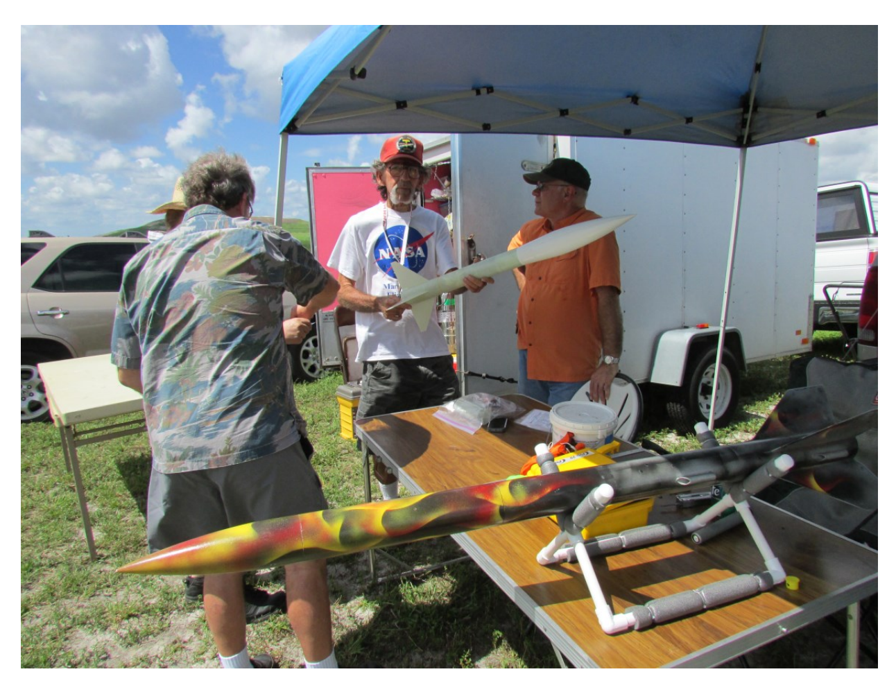
There's never a shortage of "colorful characters" at our launches!