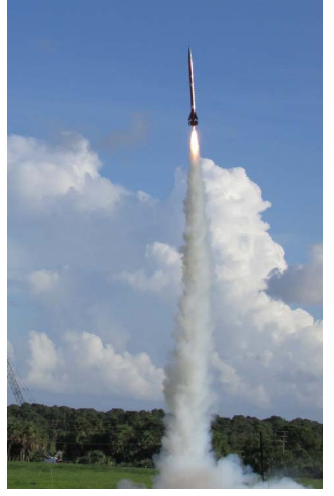
Rick Boyette's Buccaneer flew to 1200 feet on an Aerotech I211