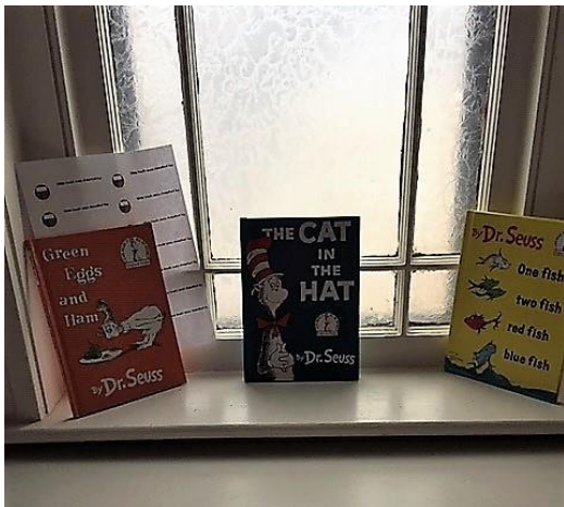
Charlotte Grelk Junction City Ladies Reading Club