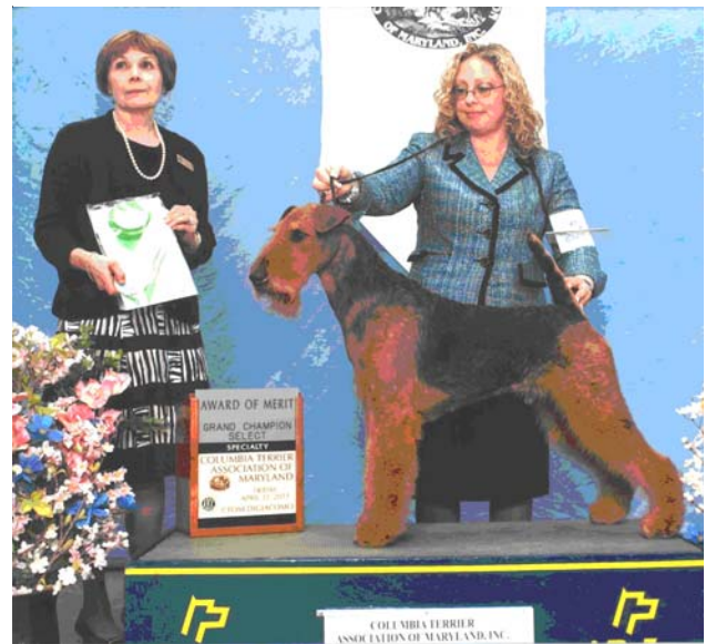
GCH VICTORIANNE CRIMSON SENTRY