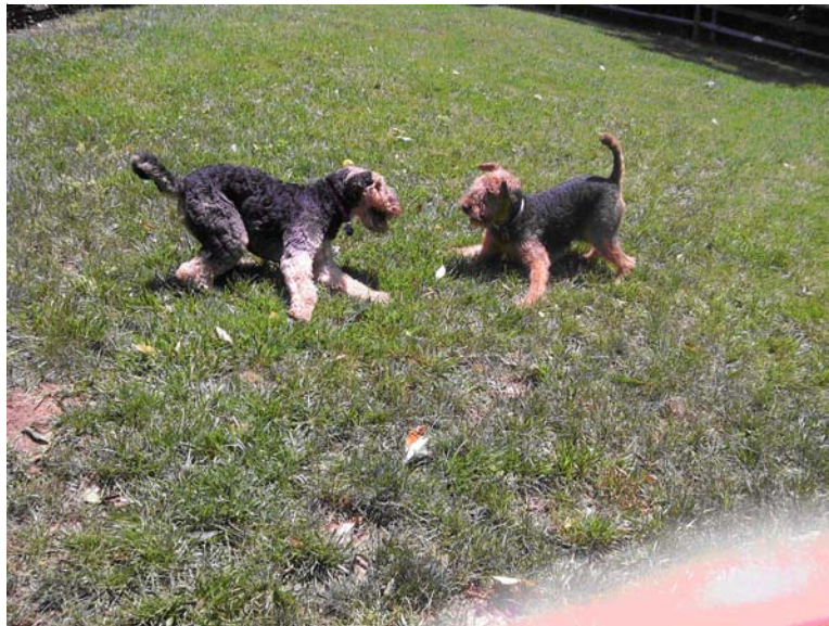
Play time with Sandi and Yogi