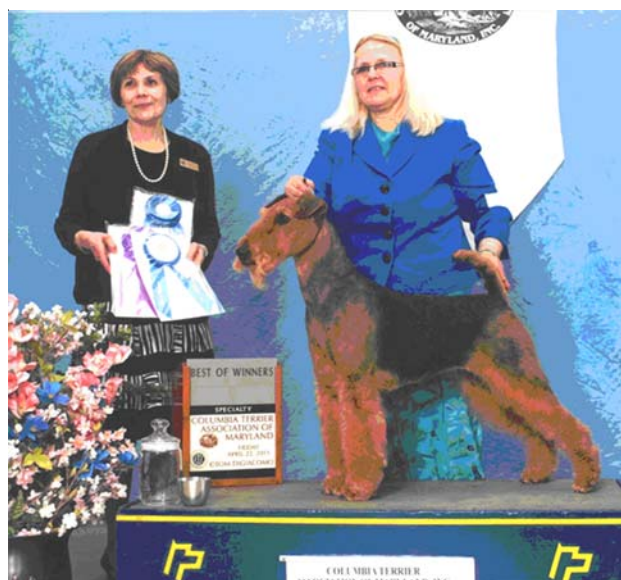
VICTORIANNE HOUSE EDGE