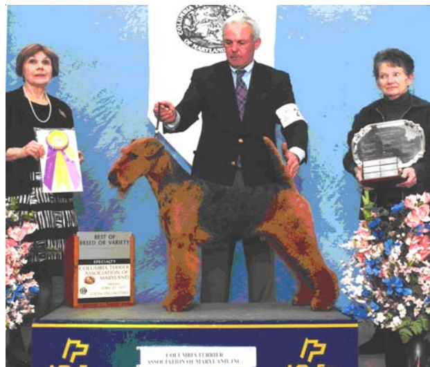
CH STIRLING MADE OF HONOR