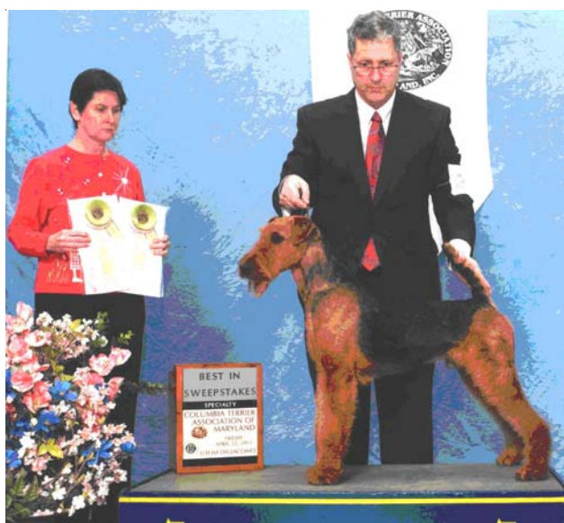
STIRLING WILDSIDE ECLIPSE