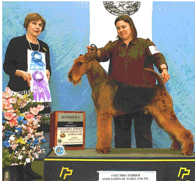
TERRYDALE HK OUT OF SPIN