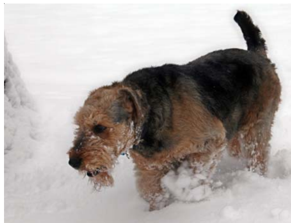
and in the Winter.

For the first time in more than 19 years, we are without an Airedale in our lives. Perhaps I should change my license plate from PAIREDL to NODALE. I don't think I will because there will more in our lives. But around our house, it is quiet right now – except for two chatty cats.