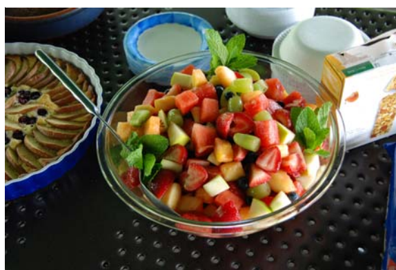
A sample of the delicious picnic food Nora Dudman assembled!