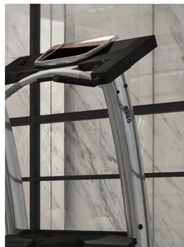
Get fit fast with a fully equipped gym at Aquabella