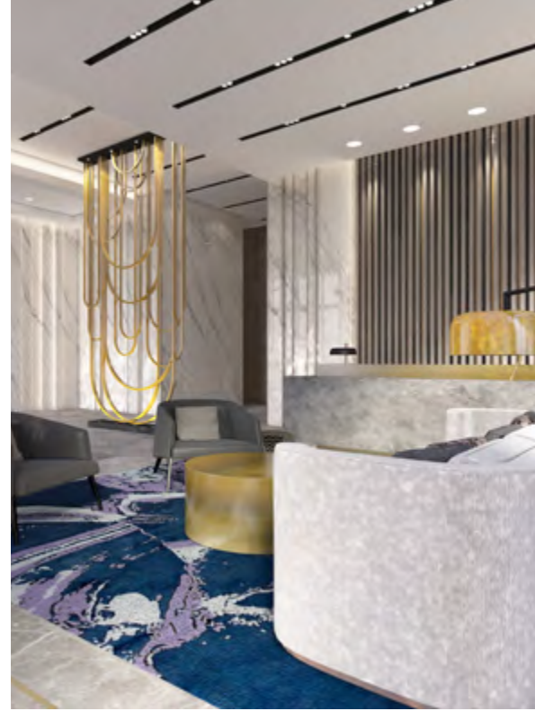
Make impressive first impressions with a luxurious lobby and a concierge that cares