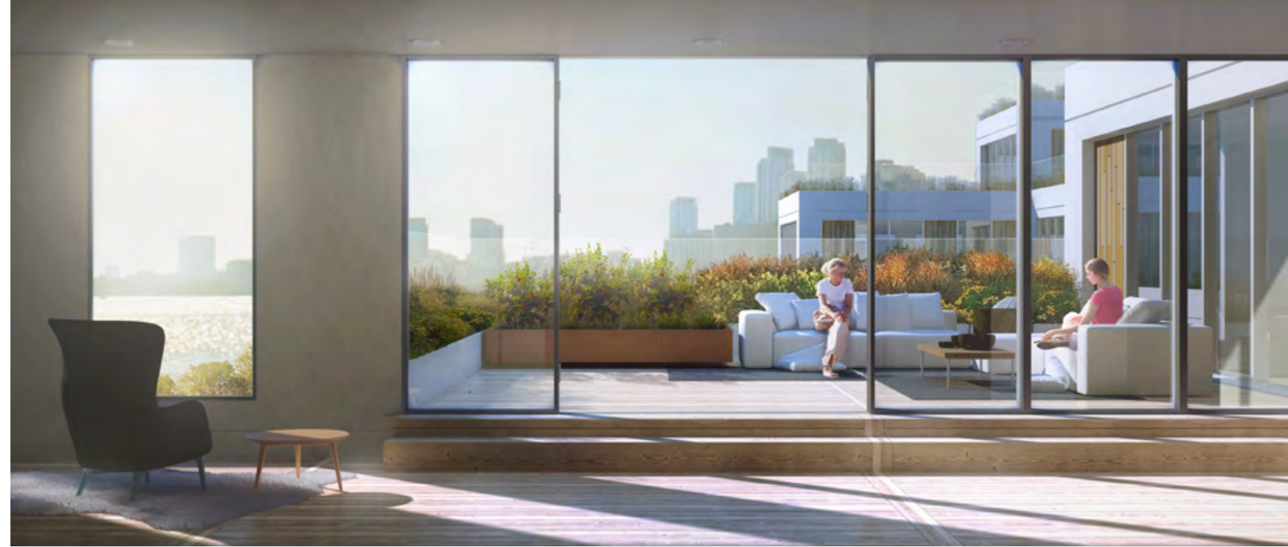
Your front row seats to the most beautiful views in the city, courtesy of Aquabella