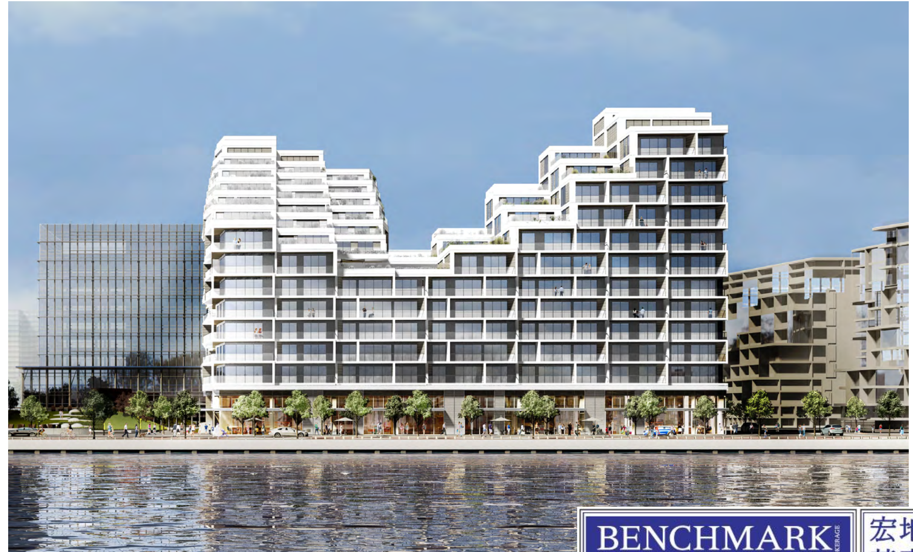
Views of Aquabella from your boat