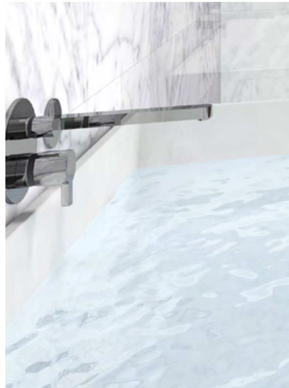
Refresh in a bathroom with truly lavish features and finishes