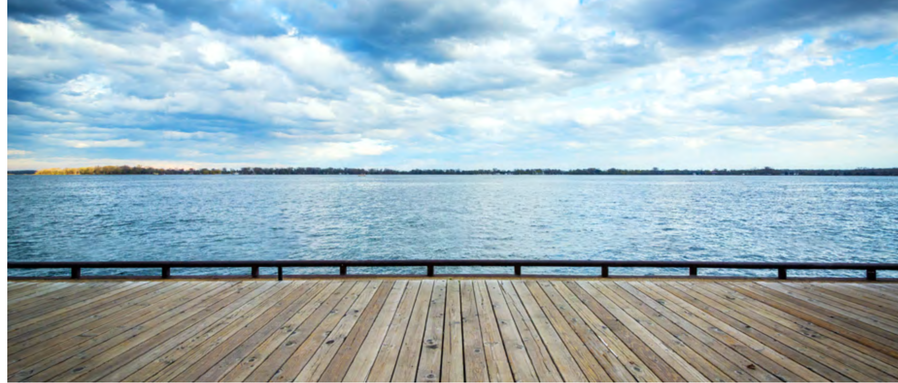
Above : Water's Edge Promenade Right : Bayside Toronto Community master plan