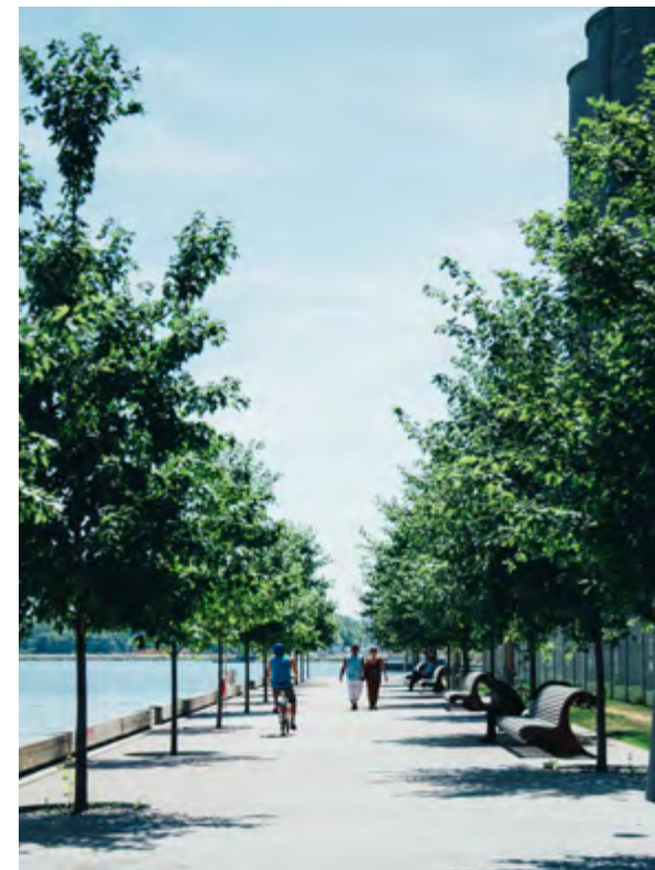
Above : Views from the shore (Pink umbrellas at Sugar Beach / wading in at Woodbine Beach / strolling at Ireland Park)