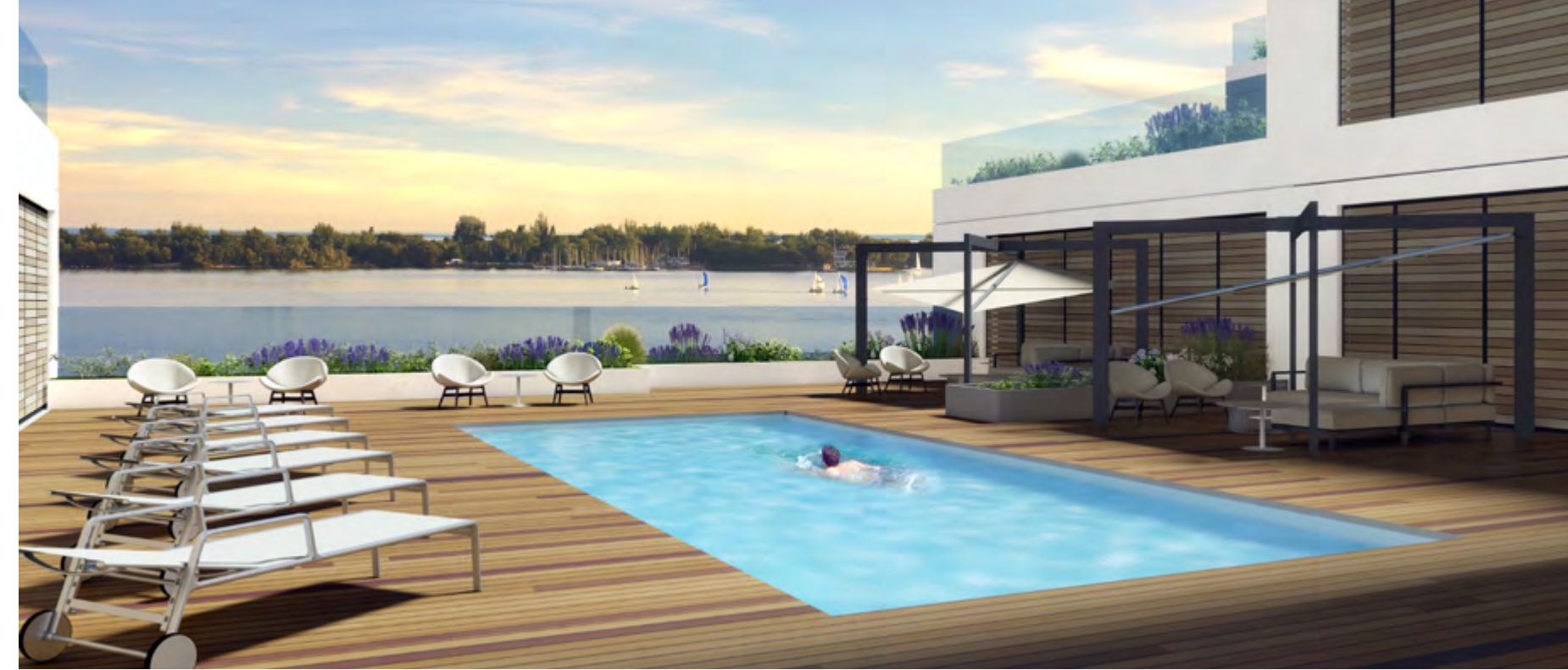
Dip your toes, make a splash or simply soak up the sun on Aquabella's brilliant amenity rooftop