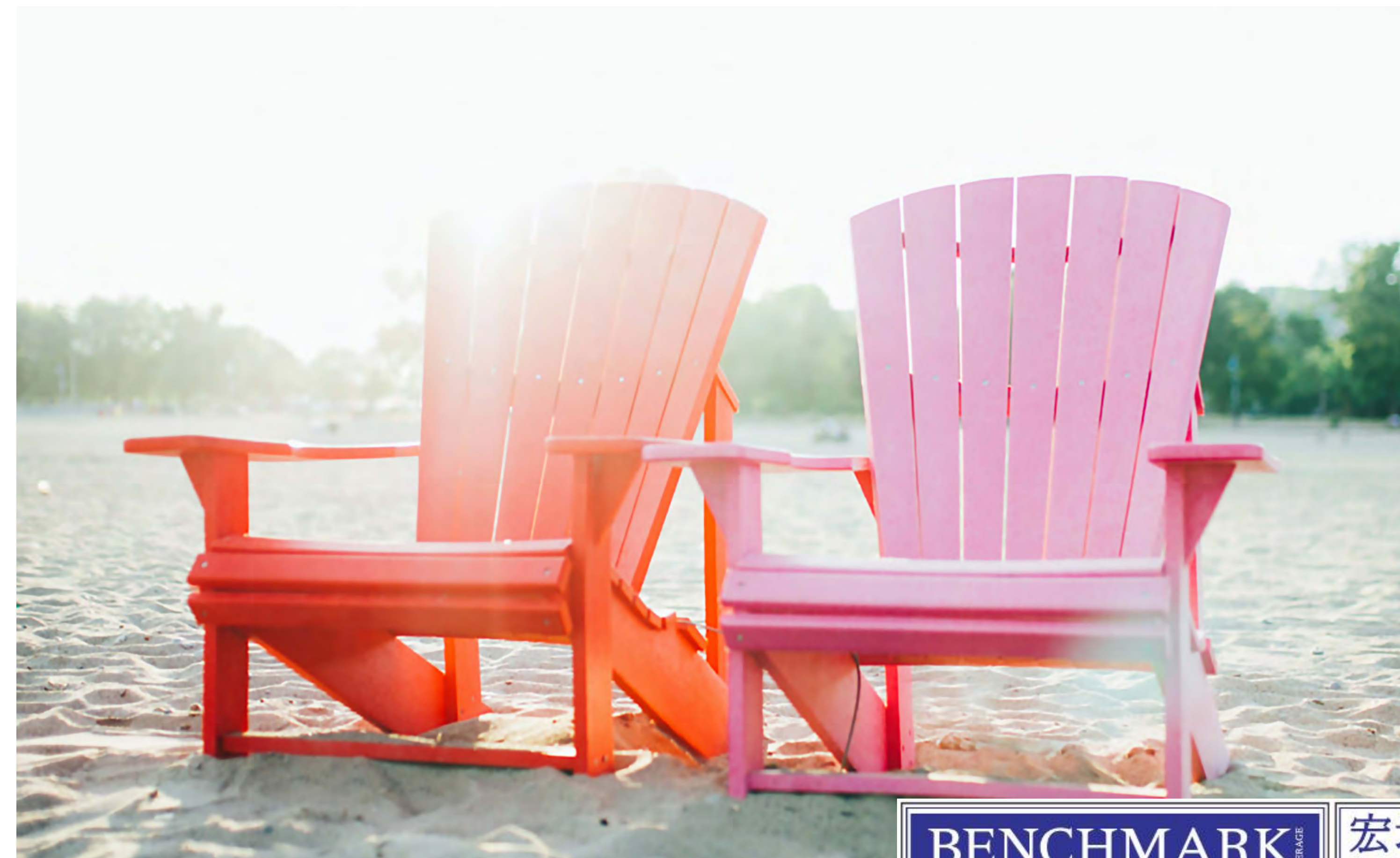
A day in the life at Woodbine Beach

BENCHMARK SIGNATURE REALTY INC., BROKERAGE