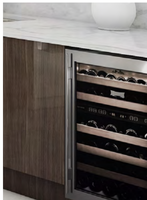
Channel your inner chef in a kitchen with premium appliances and flawless features