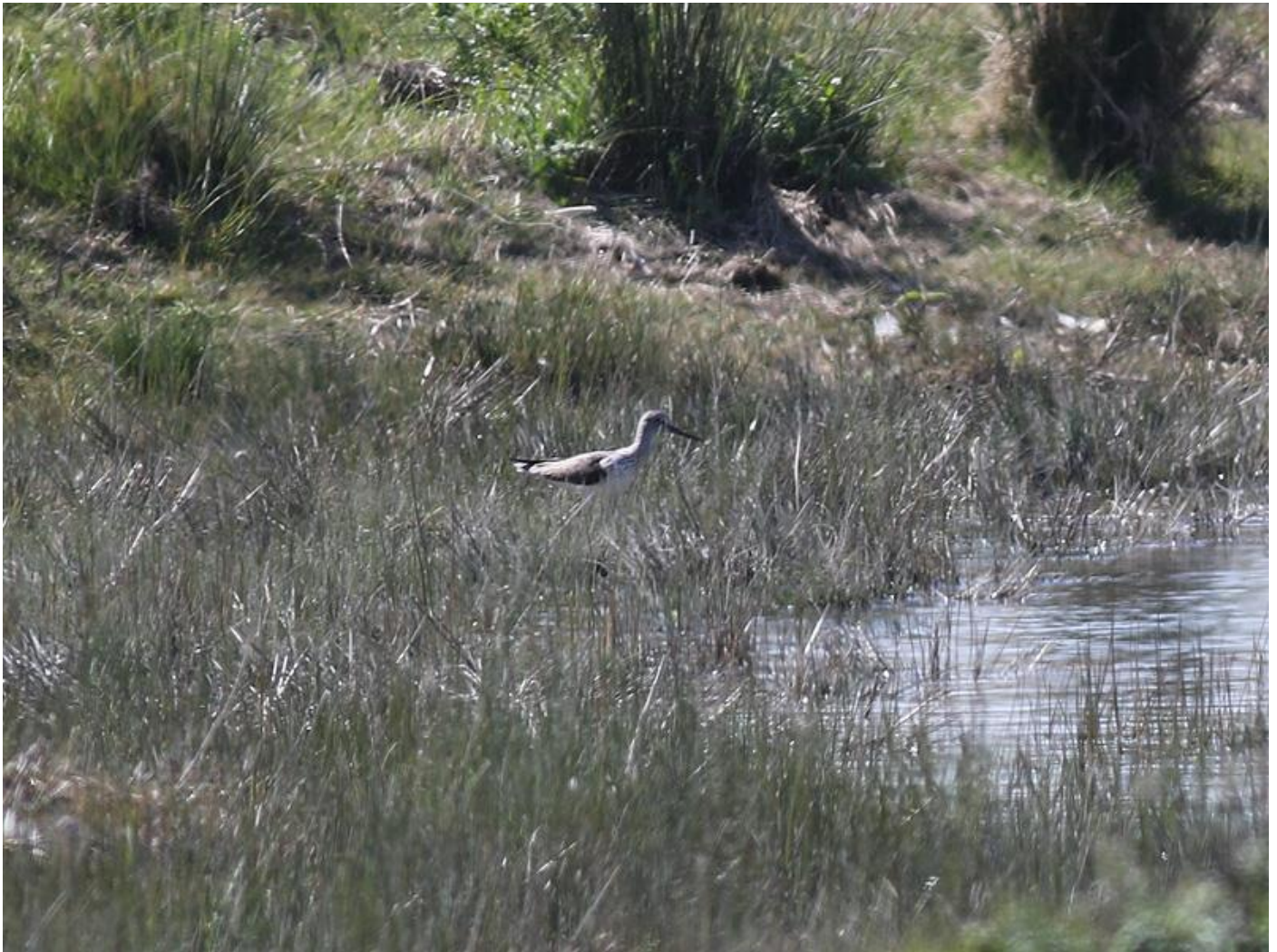
Greenshank at Donkey Street

There have been just two sightings in October, singles at Nickolls Quarry on the 10 th October 2007 and at Botolph's Bridge on the 18 th October 2002, and no recent winter records.