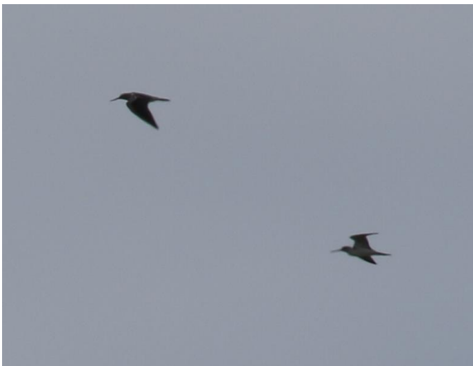
Greenshanks at Donkey Street (Ian Roberts)

One was seen at Copt Point on the 8 th August 1988, a flock of 12 flew west past Mill Point on the 31 st August 1988, one flew west there on the 6 th September 1988, one flew east there on the 4 th May 1990 and nine flew east there the following day. There have been annual sightings since 1990.