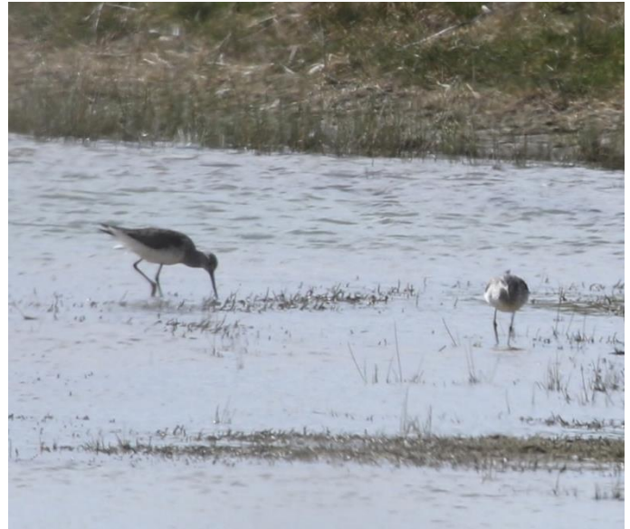
Greenshanks at Donkey Street (Ian Roberts)

In Kent it is a regular passage migrant with a few overwintering.