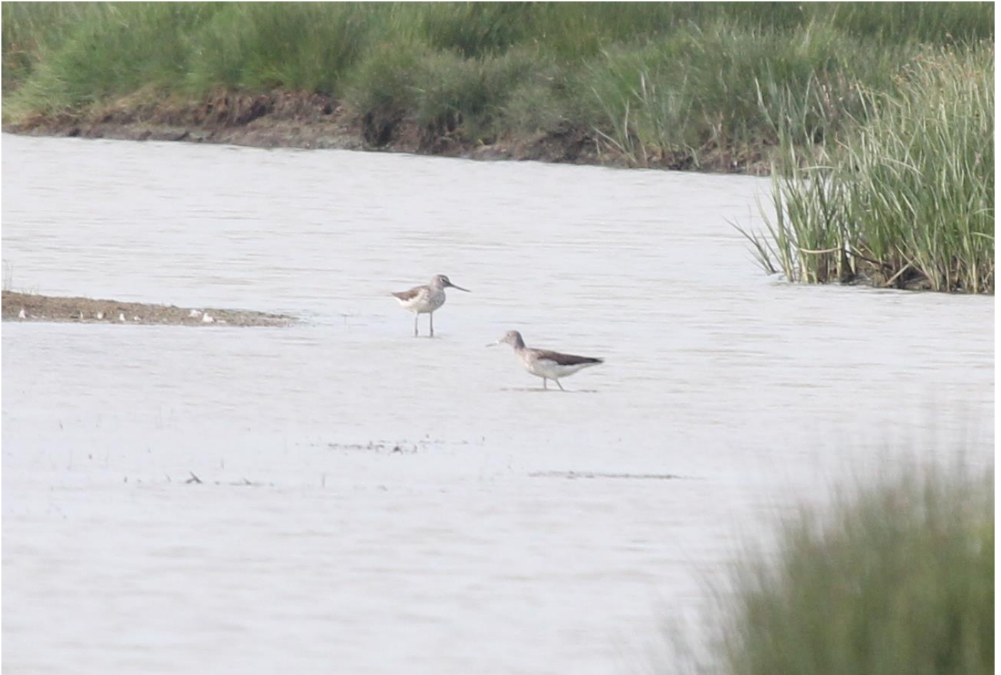
Greenshanks at Donkey Street