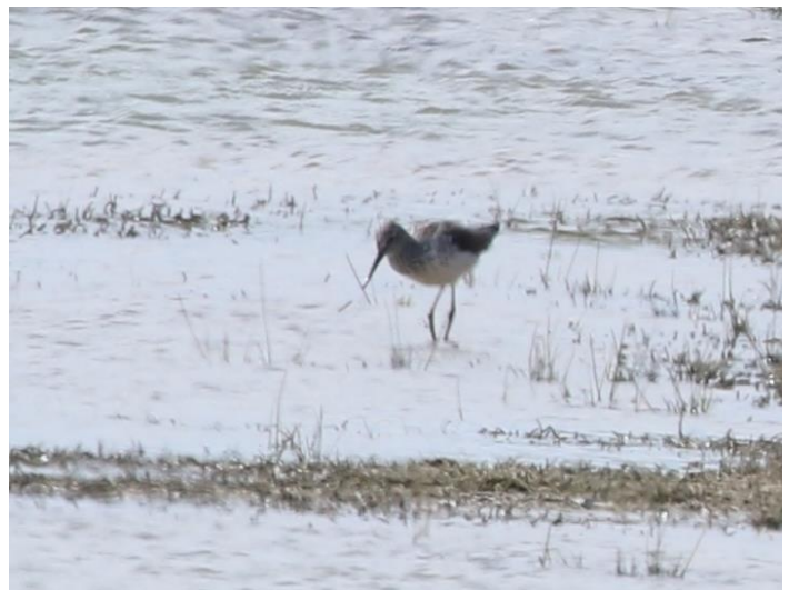
Greenshank at Donkey Street