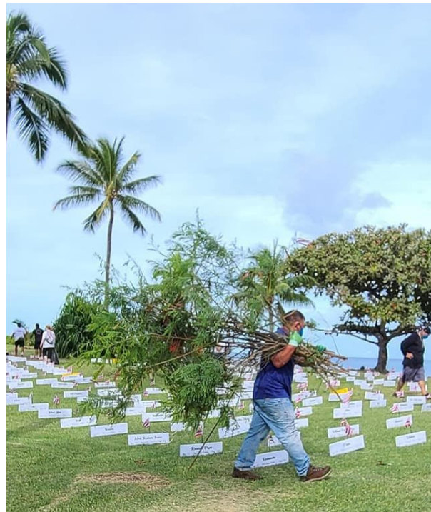
With ancestral names adorning the area, volunteers from a multitude of organizations came to clean the area of all that does not belong there.

This was a place of refuge for a thousand years, and is potentially a location in great need of protection today.