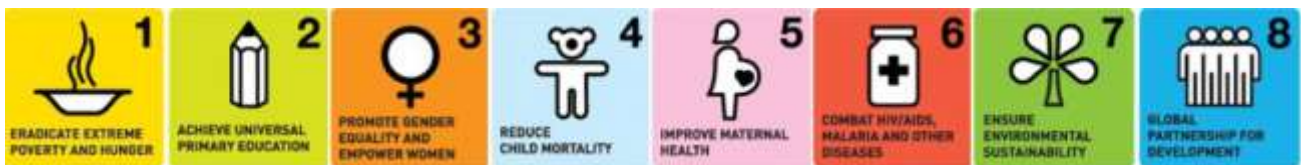
Fig. 2. The UN Millennium Development Goals (MDGs), to be realized by September 2015.