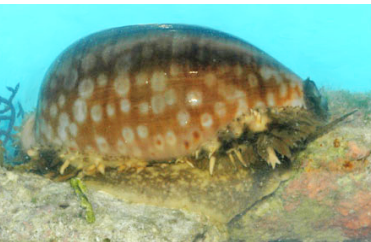
Cypraea cervinetta (Pacific) and Cypraea zebra (Caribbean)

far that they now have different species names. We suppose that, were they to mingle again, they could not reproduce with one another.