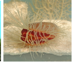
Two Lima species, from the Caribbean and the Pacific

I have many such pairs in my collection.