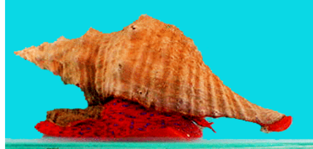
Pleuroploca princeps from the Pacific and Triplofusus gigantea from the Caribbean are very similar, except that the operculae are different.

After the closing and creation of the Caribbean, molluscs on both sides began to evolve differently. You can see definite similarities between many species on the east and west coasts of the Isthmus, but the shells have evolve so