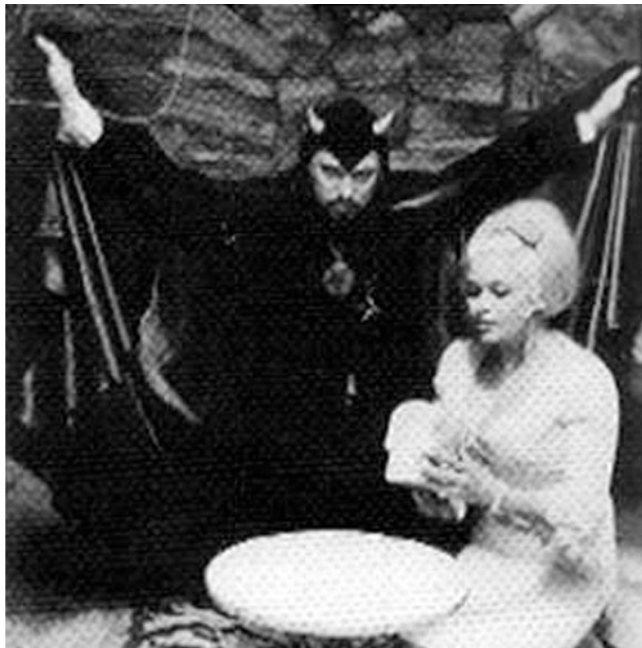
Anton LaVey and Jane Mansfield

It is the popular misconception that the Satanist does not believe in a god. The name "God", as interpreted by man, has been misunderstood by most Christians for centuries. New Agers, Satanists, Buddhists, Mormons, Muslims, etc., all believe in a god,