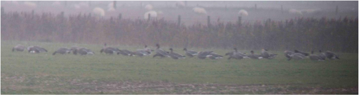
Pink-footed Geese at Botolph's Bridge (Ian Roberts)

Holling, M. & the Rare Breeding Birds Panel, 2012. Rare breeding birds in the UK in 2010. British Birds , 105: 352-416