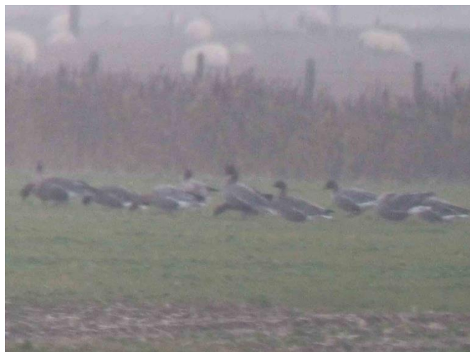
Pink-footed Geese at Botolph's Bridge (Ian Roberts)

There are two discrete breeding populations, one in Iceland and Greenland, and the other in Spitsbergen. The former winter in Britain, south to the Wash, and the latter in Demark, west Germany and the Low Countries, with a few reaching northern France and eastern England, especially in severe winters. The first successful breeding in Britain was documented in 2010 when single pairs bred in Cumbria and Highland, with another pair present in the Outer Hebrides. These records appeared to relate to wild birds which lingered in the spring perhaps because of injury (Holling et al , 2012).