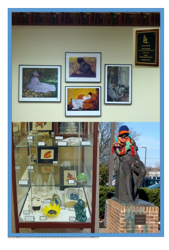
The Friends of the Newark Free Library is a non-profit organization of library supporters .

We are book lovers, information seekers, music and movie buffs. We are young and old, with varying interests and backgrounds. We treasure ideas and value the public library as a vital community resource. We believe libraries are an important community resource.