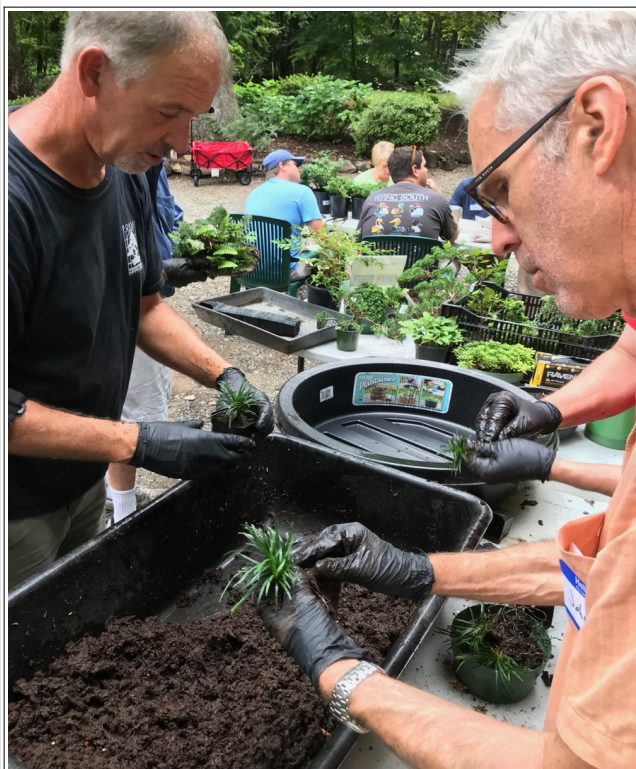
Many hands in the muck