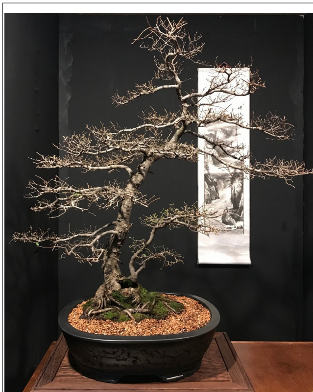
Jim's Chinese Elm 'Catlin' on display at the 2018 Southern Spring Show

Our own Jim Hanley will conduct a program on Chinese Elm as bonsai. If you don't have one of these on your bench, you need one. Here are a few pictures to whet your appetite.