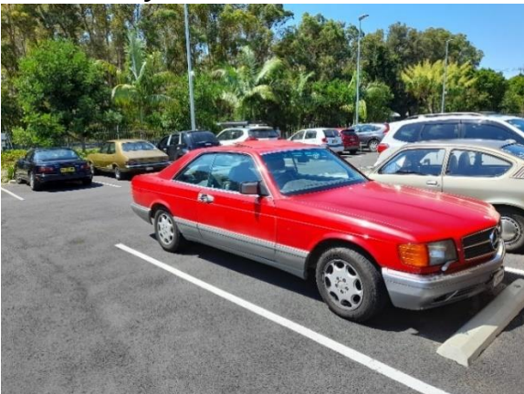
Hard to miss the Fisher Merc in the carpark...but the little Sherpa might be harder to spot!