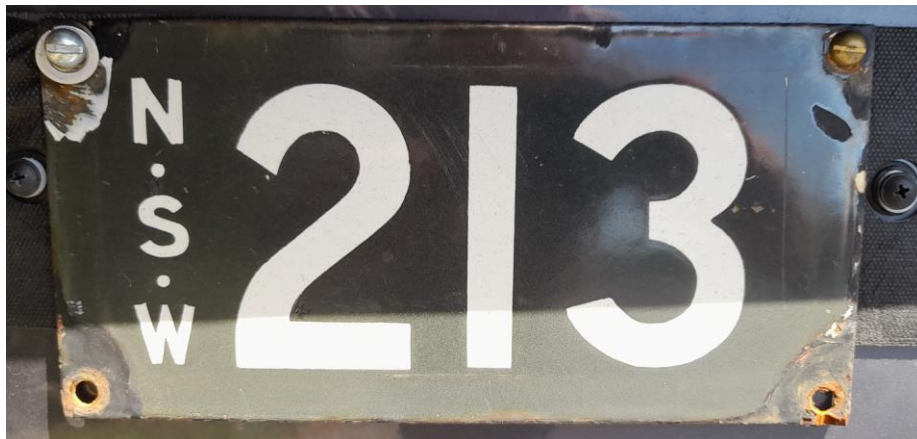
The number plate on Toon's VW X-Cross looked older than any of the cars on the run!