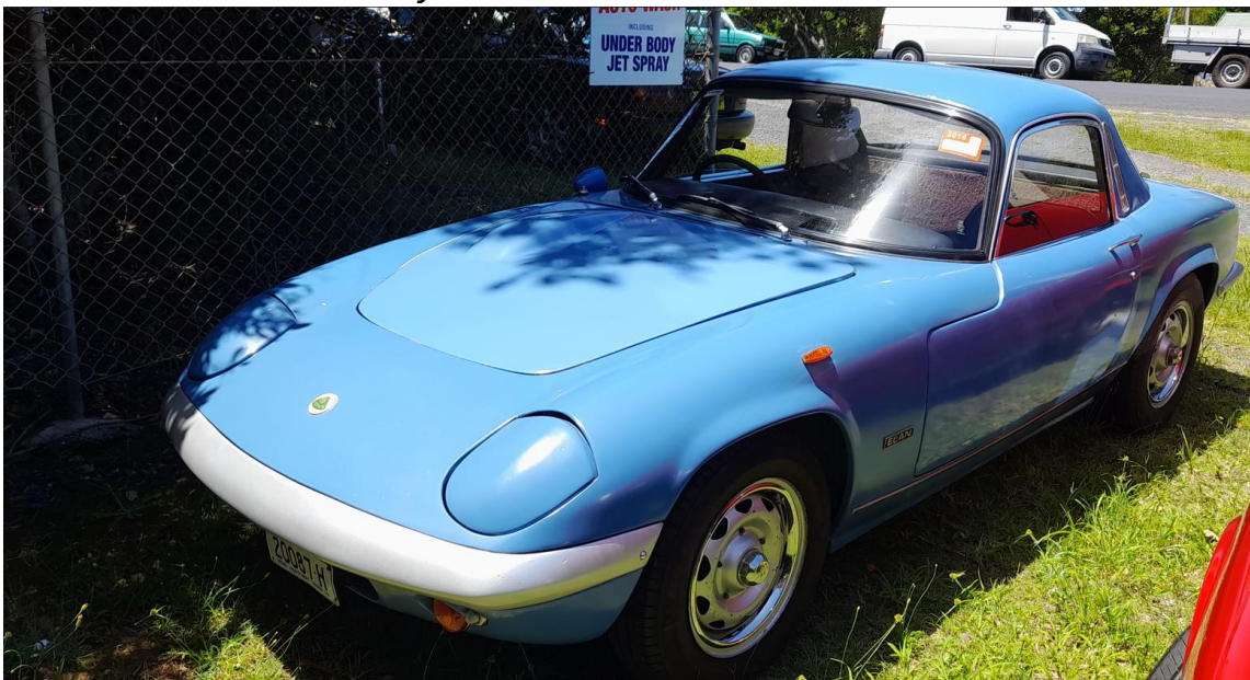
Carol snagged a bit of welcome shade for the Lotus