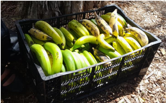
Max and Noelene brought a crate of bananas to give away!