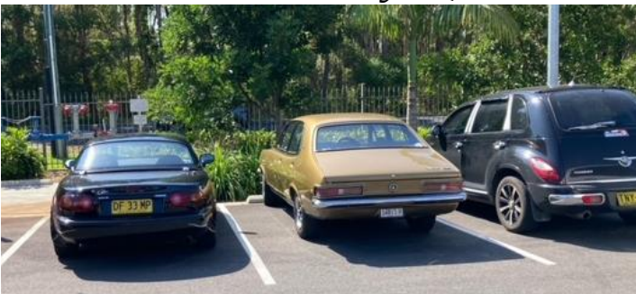
A nice set of behinds