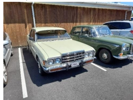
Crown & Wolseley- very regal