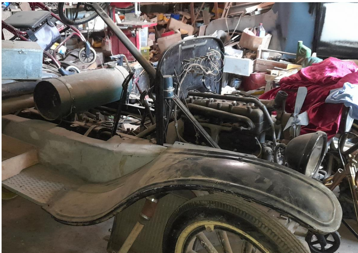
Will's second T Ford, a 1923 model, currently in rolling chassis state, but Will has been building a two-door body for it.

Thank you, Will, for showing me around your shed and also generously donating some parts to my latest folly, I mean restoration project!