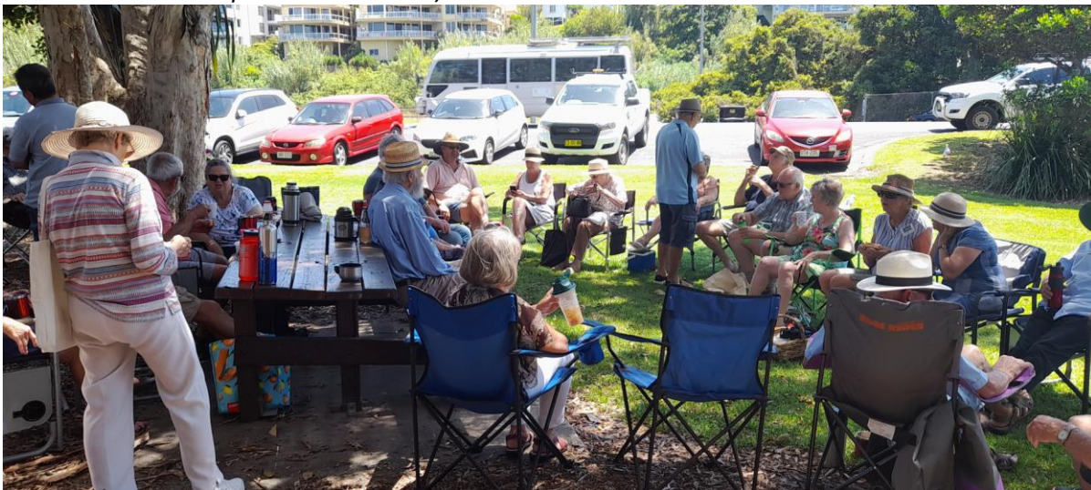
Couldn't get the whole group in one photo!