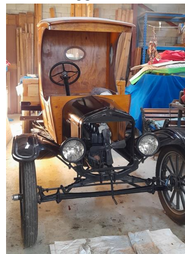
1918 Ford TT Truck