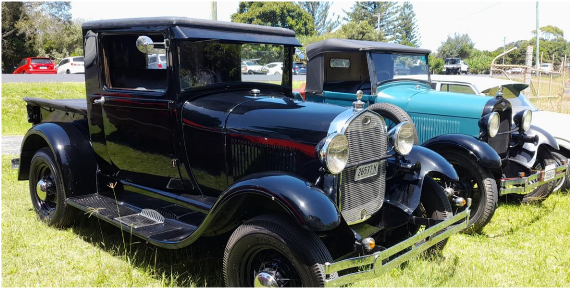
What's even more beautiful than an A Model Ford? Two A Model Fords!!