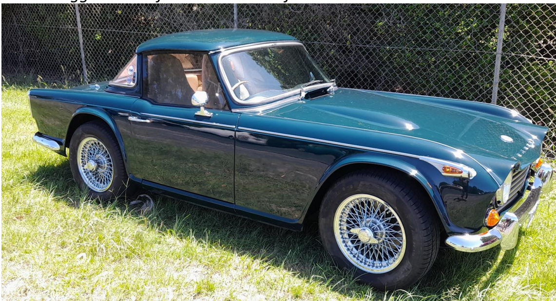
The Presidential machine gleaming in the sun