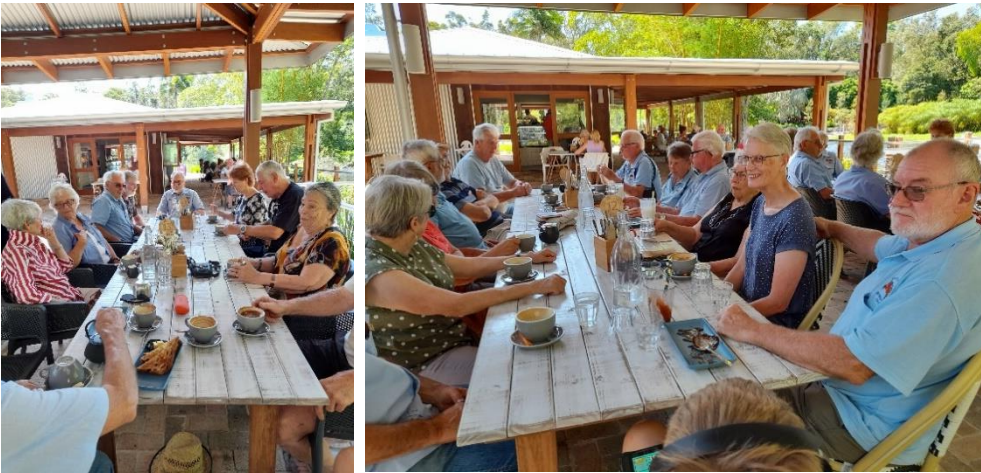
Nice to see our members Linking in! (see what I did there??)