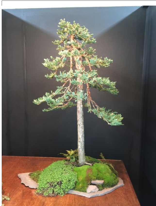
Creighton Bostrum's Blue Star Juniper