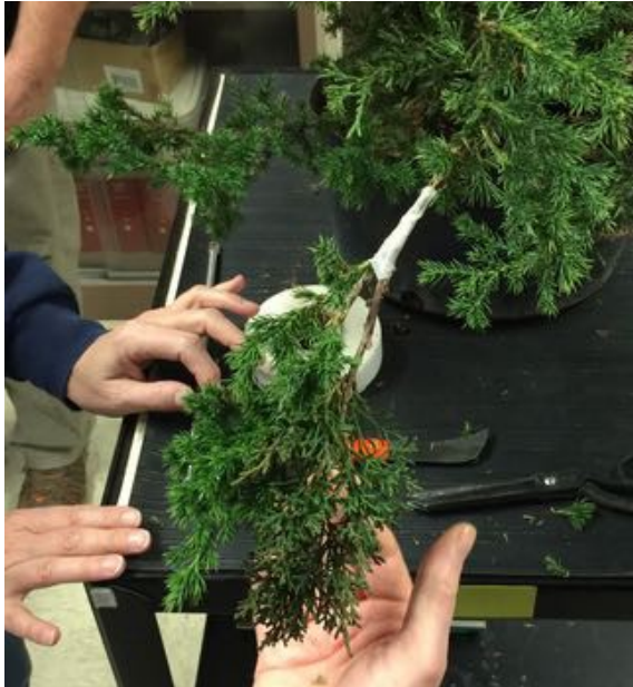
Have a dynamite tree with bad foliage? Use grafts to replace it!

website. A search for “grafting” turned up 5 pages of articles!