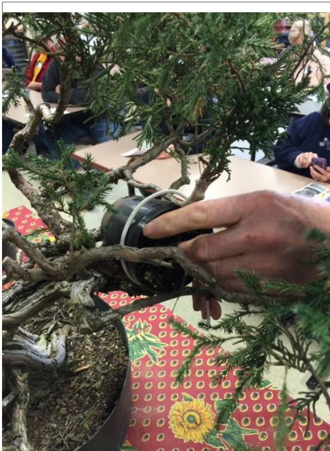
Approach grafts can sometimes be a colossal challenge! How's he going to water that?