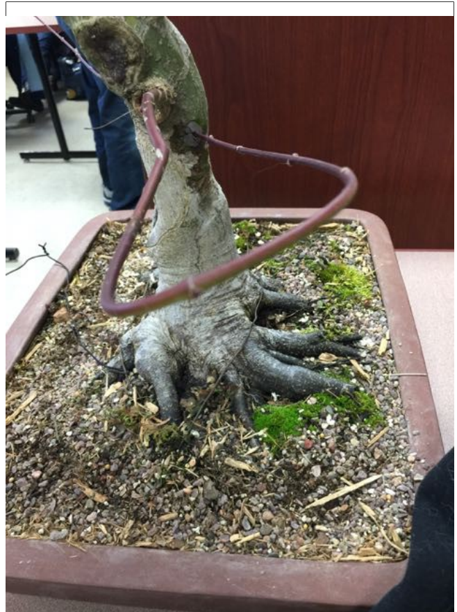
Need a branch on the "other" side of a tree? Thread graft is one way to solve the problem.