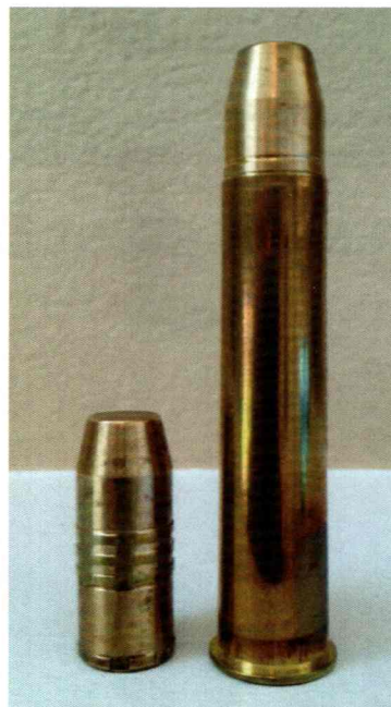
A CEB 900 gr .600 Nitro Safari SOLID™ retrieved after passing through 7 ft of elephant alongside a loaded cartridge. Note that only the bands, and not the shank of the bullet, were engraved.

was amazed, and so was I. The bullet easily penetrated 7 feet of elephant, through heavy bone, etc. It was truly amazing, and further proof for me that I am using the best bullet made."