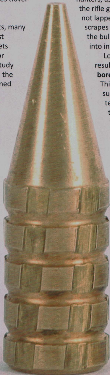
A 200 gr .375 Impala Spitzer Solid – ex gemsbok

This is then why we need to bring the peak pressure down as it has the effect to increase flame temperatures that does the cutting. By reducing the bearing surface of the bullet we reduce the amount of friction and so lower the pressure. Here is a fine example of an Impala Spitzer Solid showing a bearing surface of only 62% with which I obtained 11 mm cloverleaf groups in my 9,3 x 62mm Mauser despite the fact that some manufacturers are claiming that their “bore-riding” designs are more accurate.