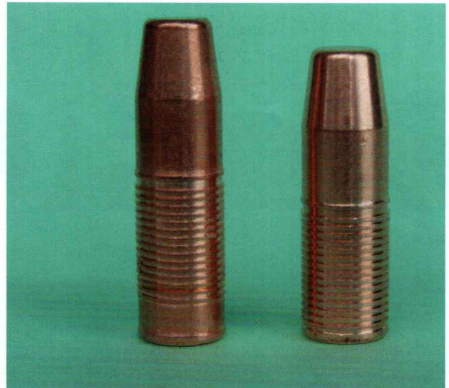
A .458 cal 550 and 500 gr North Fork FN Solid

At least I have satisfied myself that I would not lose any sleep over the use of copper or free-machining brass bullets, as I see the main culprit as throat erosion by the flame-cutting effect of the hot gases rather than bullet abrasion. Let me put the matter into perspective: a .458