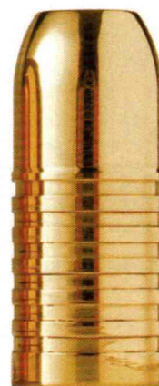
Barnes Banded Solid

Still sceptical? Of course you are. You want proof and we figured you would, so we performed pressure tests. Hopefully, the results will put this myth and your mind to rest. While we were at it, we shot some penetration tests to compare Barnes bullets with one of our leading competitors on the African market. I believe the ‘high pressure with all mono-metal solids’ propaganda was spread via the old ‘someone heard something from someone’ and so on, and so on. If someone out there is aware of an actual case involving pressure issues with Barnes mono-metal solids, I would ask that these people contact Barnes personally. We would like the opportunity to investigate any such claim. Based on our tests and experi-