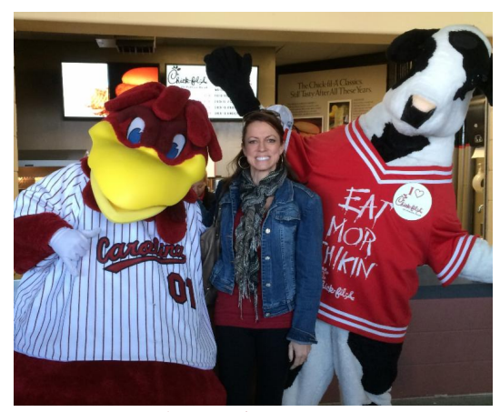
Cocky & Chic-Cow, do!

Goddess Of Truffles, LLC www.goddessoftruffles.com