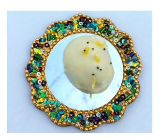
Eostre (goddess who resurrects the light of dawn & Spring)

White chocolate, lemon & poppy seed ganache / enrobed in white chocolate / garnished with lemon zest & poppy seed