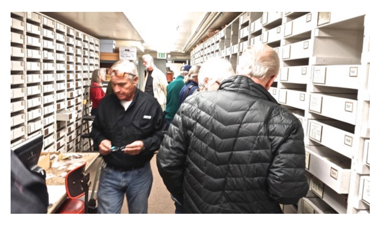
DAS members are shown browsing through the achieves.

The large pots are from the Southgate Golf Course area of St. George.