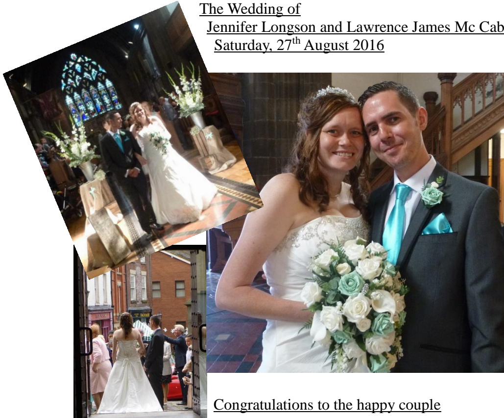
Congratulations to the happy couple

Many thanks to those who supported the “Sunday Lunch” during our Heritage Weekend. Our “Roast Beef and Yorkshire Pudding” raised £125.00 towards church funds.