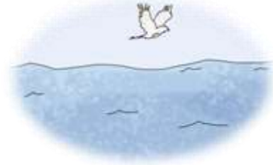
The dove could not find dry land and returned to Noah