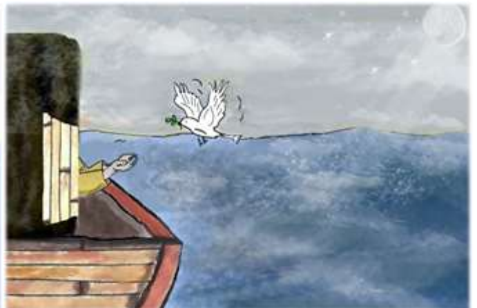
In the evening the dove returned to Noah with an olive leaf in her mouth! She found dry land.