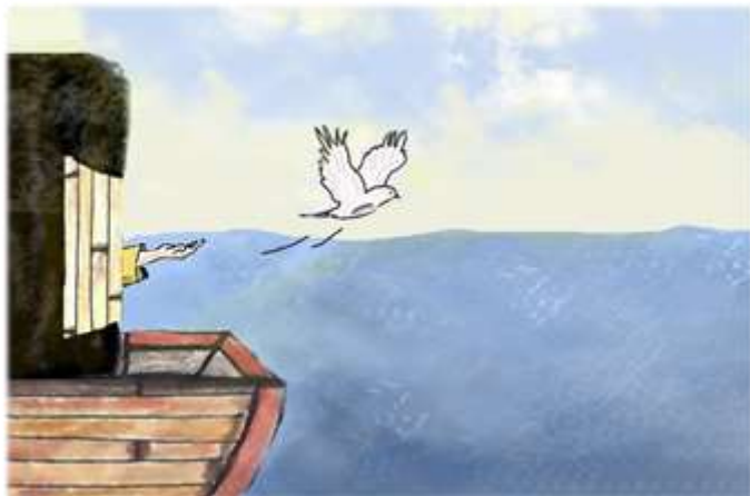
He waited seven more days and sent the dove out again.