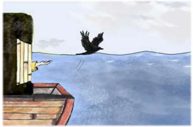
At the end of forty days, Noah opened the ark window and sent out a raven to find dry land.