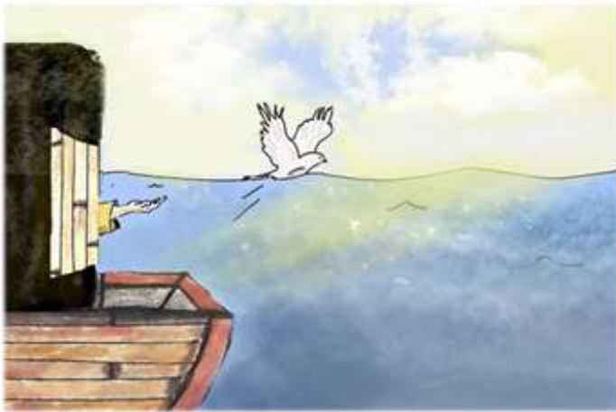
Noah also sent out a dove to find dry land