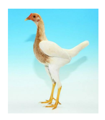
Federation Championship Show, December 2013 Staffordshire UK