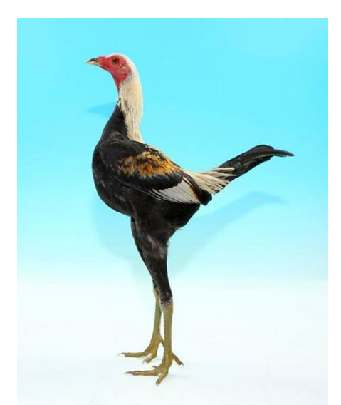
Champion Modern Marc McCullough whose Gold Duckwing Male This Modern continued on to become the Federation Champion bird of Show