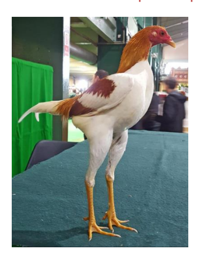
Champion Modern Graham Cannell's winning pile male