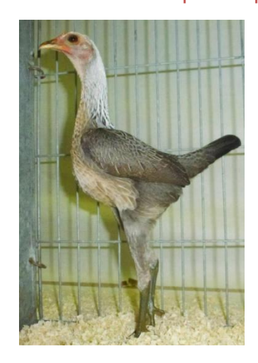
Champion Modern Graham Cannell's Duckwing Pullet