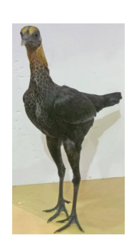
Federation Championship Show, December 2012 Staffordshire UK