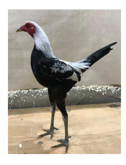
Best Silver Duckwing male, Cockerel Owned by Simon Mckean