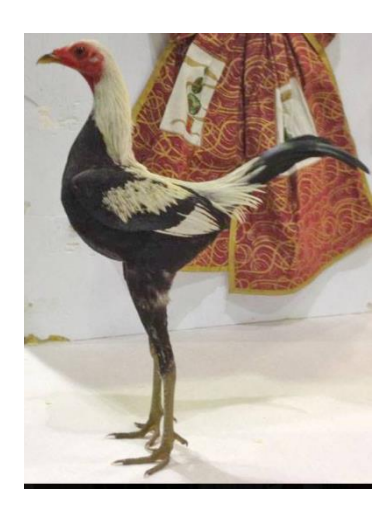
Champion Modern Mark McCullough's Silver Duckwing male