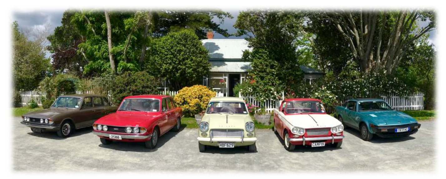
Photo: Hawthorn Dene - Venue for Show n Shine 2018 - Richard Wooster