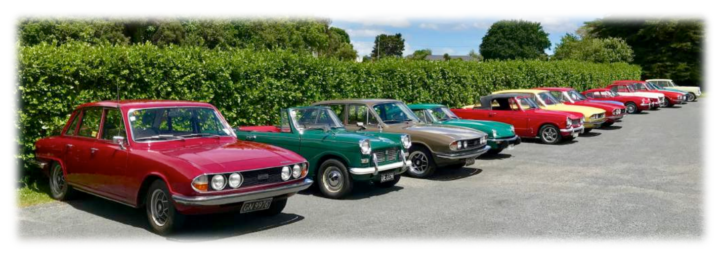
East Auckland Run - Clevedon Hotel Car Park