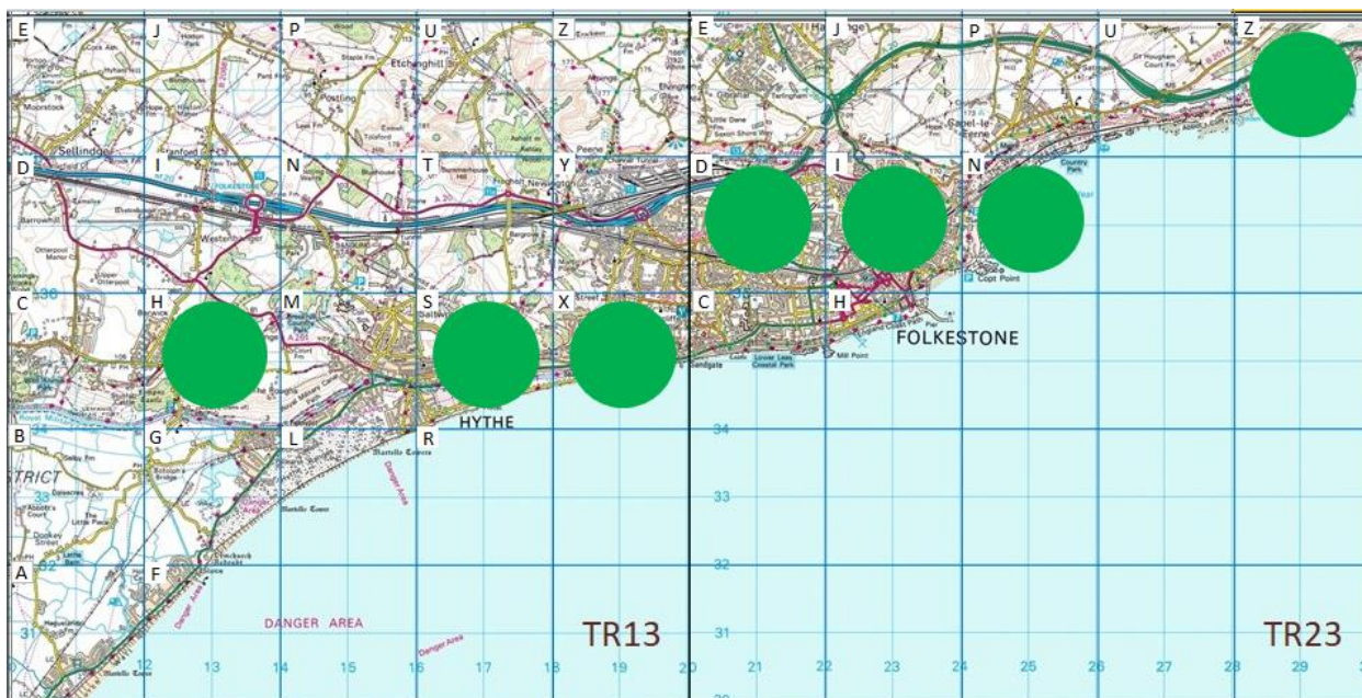
Figure 3: Distribution of all Species records at Folkestone and Hythe by tetrad