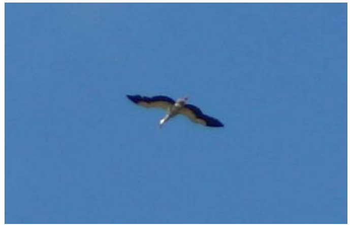
White Stork at Folkestone (Dale Gibson)

Breeds on the continent from Spain, through France, into Germany and beyond into eastern Europe and Russia. Some winter in the southern part of the breeding range but the majority migrate to tropical Africa, Iran or the Indian sub-continent. There has been a significant decrease in the north and west of the European range which has been offset to some extent by introduction schemes, including at Knepp Wildland in Sussex where a pair bred successfully for the first time in 2020.