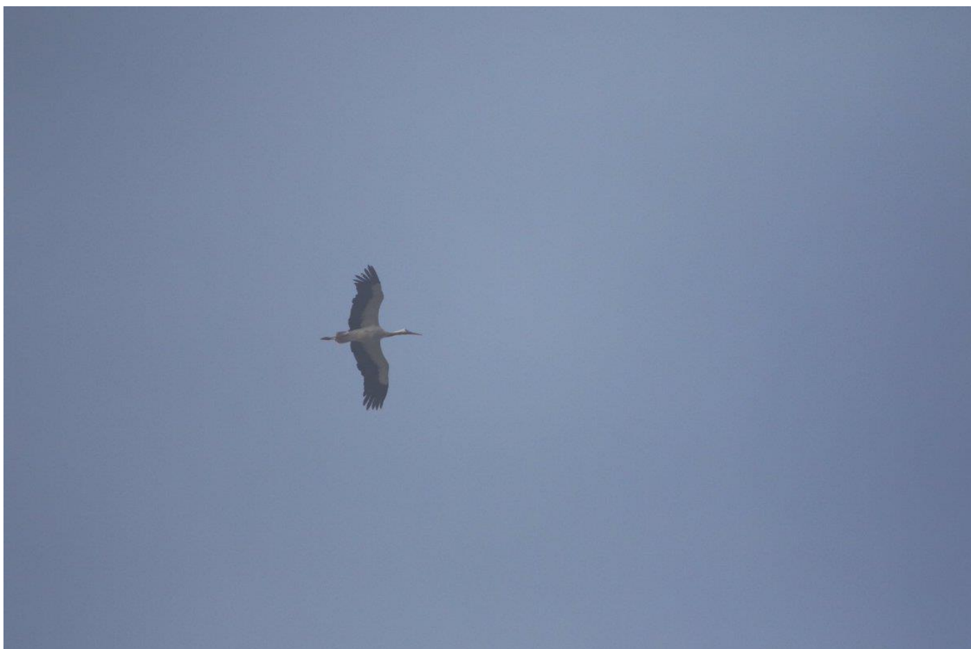
White Stork at Samphire Hoe (Shelagh Wright)