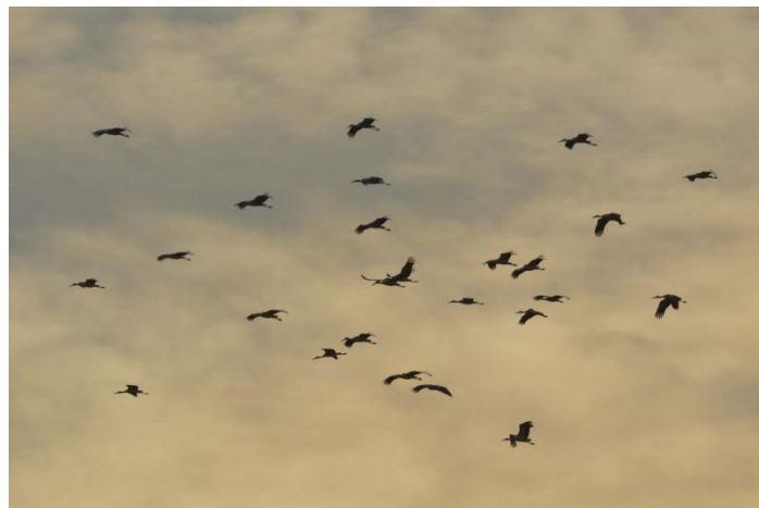
White Storks at Etchinghill (Ruth McCabe)