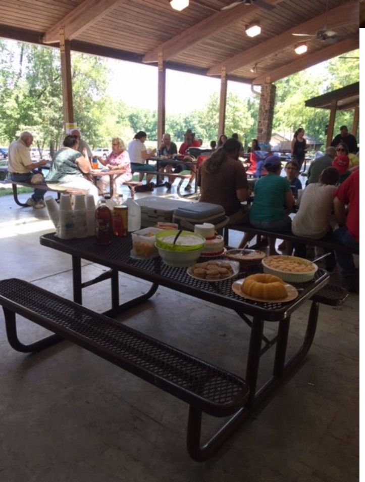
EARA PICNIC 2020