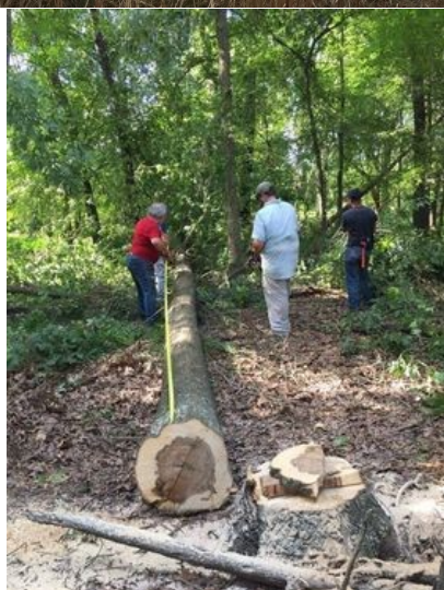
Assorted pictures of Prairie D'Ane site and work going on to improve site.