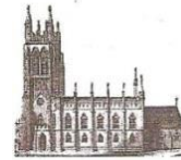
St Mary's in the Marketplace

Work will continue to sift through various boxes of files and papers to determine what else is appropriate to deposit at Chester, retain at St Mary's or otherwise disposed of. A look out is being kept for interesting articles and items of information that we can share in the Parish Magazine or other such publication.