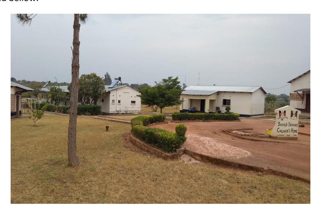
Orphanage viewed at an angle

There are a lot of activities which have been implemented successfully at SOCH in the year 2019. SOCH owes gratitude to all its sponsors and supporters who have made SOCH dreams come true in third quarter of the year 2019. In brevity, a glimpse of what has been done is illustrated bellow.