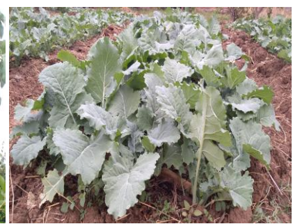
Water and green vegetables