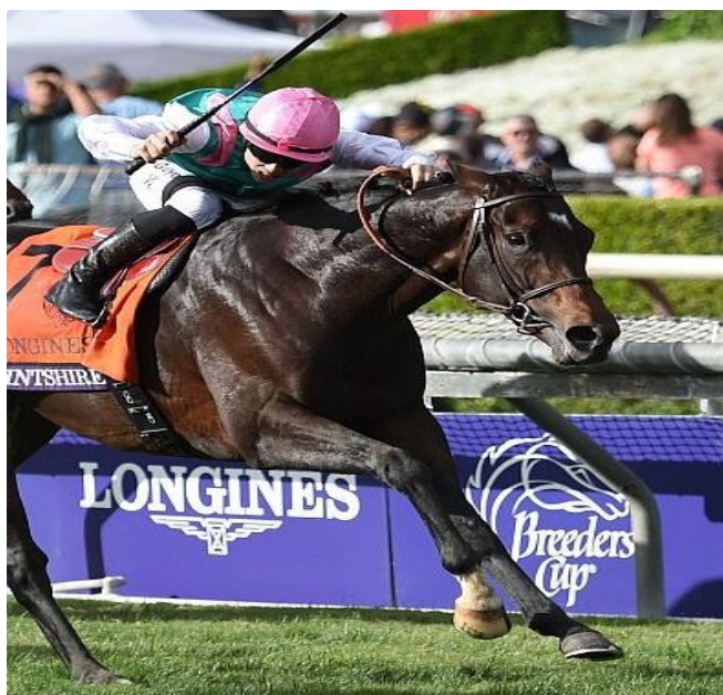
Flintshire at Santa Anita.

Flintshire was a Group One winner in France as a three-year-old and in Hong Kong last year, but he has often been a bit of a 'nearly horse'. Runner-up efforts in three championship events, in three different countries last year confirms what a good horse he is, and Flintshire certainly deserved it when landing the Hong Kong Vase (G1) at Sha Tin in December.