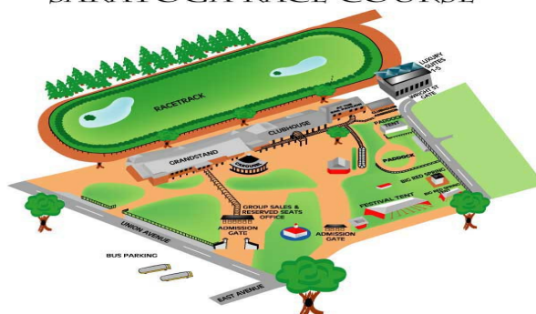
SARATOGA RACE COURSE