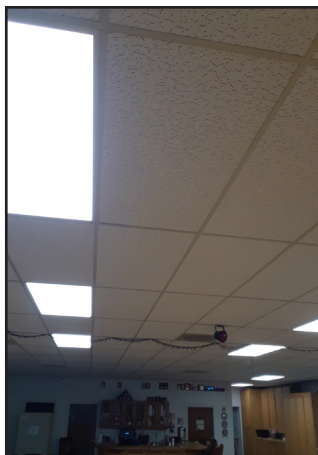
Checkout the new ceiling and lights