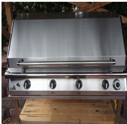
Checkout the flowers and the new grill at the Post!