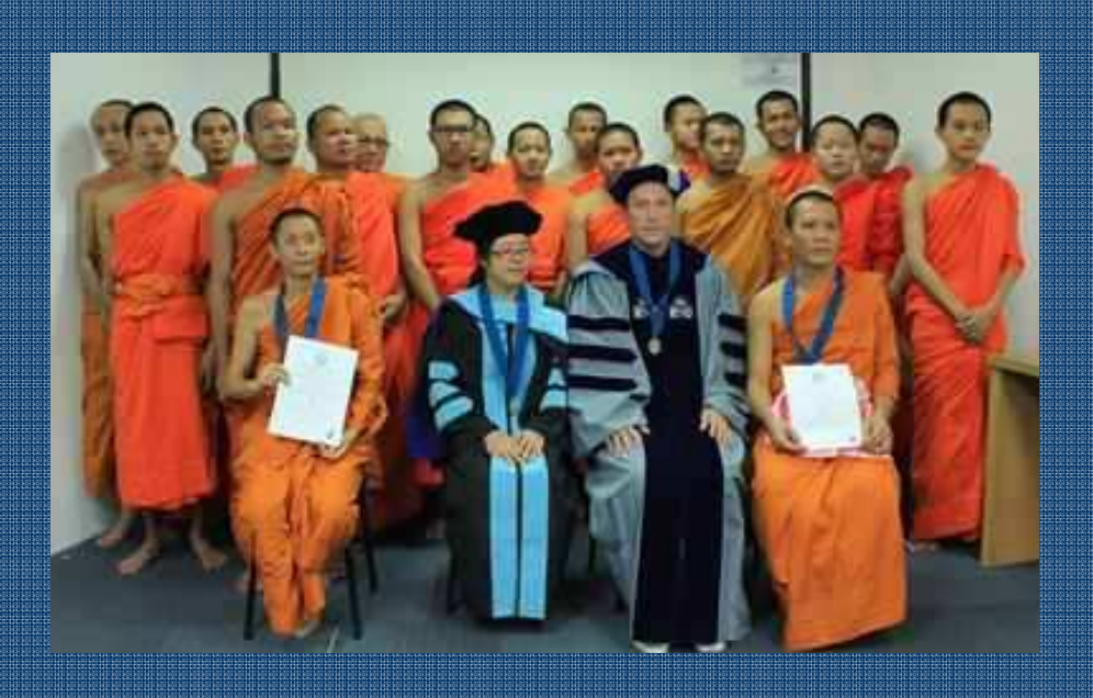
Academicians of Social Science from Wat Vorajanyavas, Bangkok, Thailand