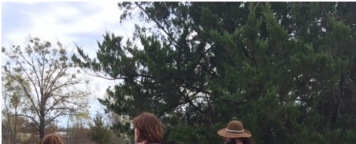
Campers at Archery Range

We did have Blue Skies at least for a little