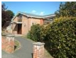
St. Patrick's Church

Broad Green/Cowley Drive Woodingdean BN2 6TB