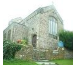
Our Lady of Lourdes

Broad Green/Cowley Drive Woodingdean BN2 6TB